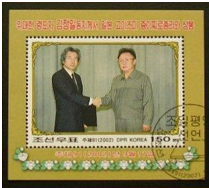
North Korean Stamp to Commemorate the Koizumi Visit