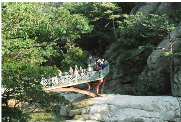
Mt. Kungang. Tourists cross bridge

The South Koreans were the ones who paid, the North Koreans provided the services. What a far cry from the proud ultranationalist ideologies of chuch'e and sŏn'gun . Later, to make matters worse, tour buses from the South entered not only the scenic but largely isolated mountain, but also the densely populated city of Kaesŏng. As cultural exchange, it was surreal. North Koreans on their way to work were stared at like animals in a zoo. All they could do was stare back and wonder.