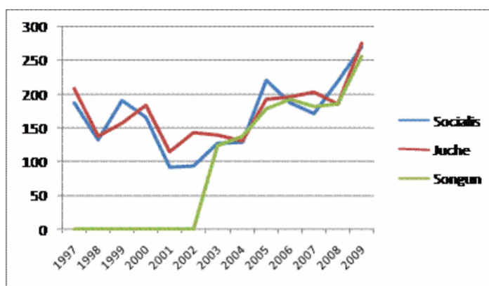
Number of KCNA articles with the terms "socialist/socialism", "juche" and "songun" in the 4th quarters 1997-2008, and the 1st quarter 2009

Kim Jong-il now seems to be trying to turn back the wheel of time. Today, we see a complete reversal of the policies of 2000-2004. In January 2001, in the official Rodong Sinmun newspaper, Kim Jong-il wrote: "Things are not what they used to be in the 60s. So no one should follow the way people used to do things in the past." However, in March 2009 he declared that officials should "energetically lead the masses by displaying the same work style as the officials did in the 50s and 60s." We can chart this march backwards: The utilization of the terms "socialism," "chuch'e" (the official state ideology of North Korea) and "sŏn'gun" (the government's "military first" policy) by North Korean state media has doubled from 2004 to 2009.