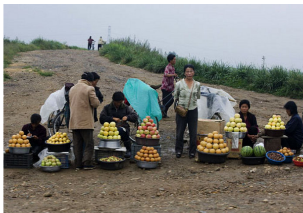
Roadside market in North Korea

The major point is that within a relatively short time North Koreans discovered, many for the first time, that there is life outside the grace of the state. They suddenly realized the power of money. Their values changed accordingly and moved closer to what most of the world considers as a given. They understood that money can secure livelihood, buy power and even health, and that, unlike the state with its politically motivated favors, money is largely impartial. The socialist system of economic management and political guidance started to look outdated. The once largely egalitarian society experienced a swift diversification – suddenly there were winners and losers, many unanswered questions and growing individual ambitions.