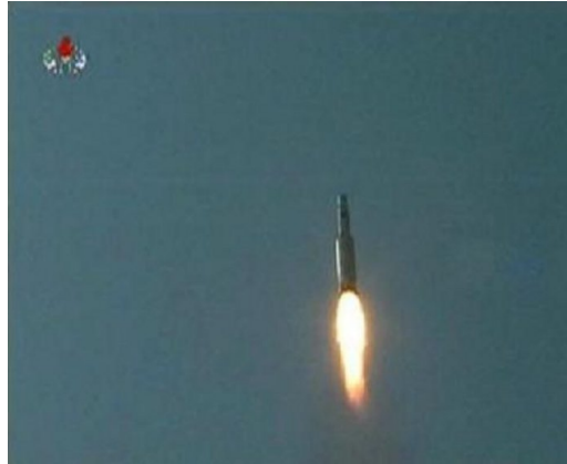
Taepodong-rocket launched in April 2009 by North Korea

After the launch of a three-stage rocket in April and the second nuclear test in May 2009 it seems less realistic than ever to think about opening and reform in North Korea. Inter-Korean relations are deteriorating almost daily. Hard-line orthodoxy has been returning to North Korea since late 2005 at an alarming pace as the country enters an era of socialist neoconservatism that emphasizes self-reliance and mass campaigns, cracks down on previously promoted market activities and stresses anti-imperialist struggle more fiercely than throughout most of the last decade.