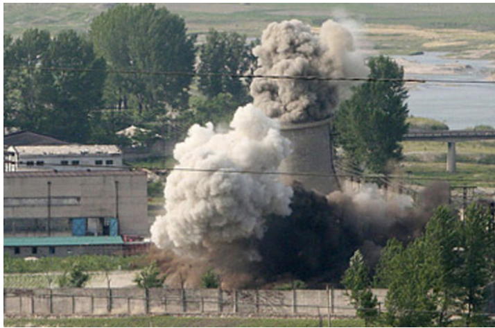
Destroying the cooling tower at Yongbyon

By removing North Korea from the ledgers of U.S. laws and regulations, the U.S. government eradicated a number of significant U.S. legal restrictions on North Korea. This seemingly cleared an avenue for a free flow of goods and capital to and from North Korea, and for Pyongyang to apply for international financial assistance. Further down the road, normalized U.S.-North Korean relations now appeared possible. Less clear, however, is that U.S. policies, laws, and regulations with respect to North Korea are filled with replication and overlap. Despite the significant legal actions taken by the U.S. in June, what remained was not a clear path toward improved U.S.-North Korean diplomatic and economic relations but multiple layers of U.S. executive orders, legal actions, and public laws that continued to place onerous restrictions on North Korea.