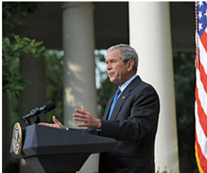
President Bush lifting the designation of SST

On the same day that President Bush issued the proclamation terminating the exercise of authority under TWEA with respect to North Korea, he also reauthorized Executive Order 13466 . This order characterized North Korea's nuclear activities as an "unusual and extraordinary" threat to U.S. national security, and authorized the continuation of certain restrictions with respect to North Korea and North Korean nationals. Similarly, although the U.S. rescinded North Korea's designation as an SST, the legal restrictions that were applicable under the SST remain in place under the auspices of different laws.