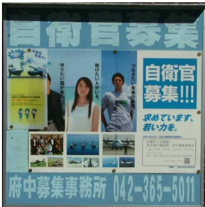
Figure 1: "Self-Defense Force service members recruitment: We appreciate it – young strength. There is a future to which I want to connect. There are people I want to help. There is a land I want to protect" (Self-Defense Forces recruitment poster, 2005.).

Constituting specific aesthetizations of the Self-Defense Forces that are unique compared to those of other militaries, they are only slightly bigger than 1.5 feet by 1.5 feet. The language of "the nation," informal pronouns for "you," "pride," "friend," and technology of the 1950s and 1960s have given way to more