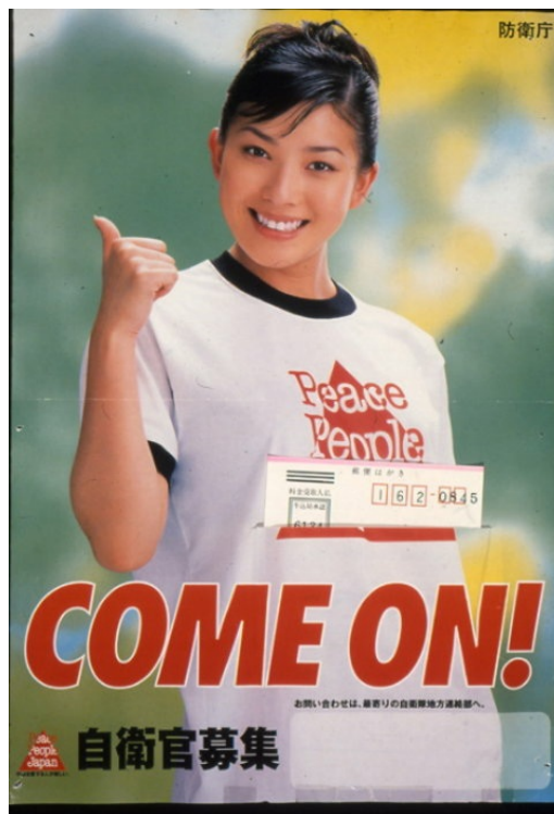
Figure 2: Today, public relations and recruitment posters of the Self-Defense Forces typically feature young, cheerfully smiling women and decisively non-militaristic slogans such as “Peace People Japan – Come On.”

Female figures render benign the notion of “pride” that otherwise could be associated with nationalism and imperialism. They are promoted as the peaceful gender: their smiling faces seem to suggest that there are nice, pretty women even in the Self-Defense Forces, and that they would not be here if the military were a violent, strange, dangerous organization. Representations of women in recruitment posters work in this fashion because of the naturalized pairing of “woman” and “peace” that mirrors a style of wartime propaganda which had established a strict gender division of men as combatants at the front and women as mothers, wives and supporters at home. I have shown elsewhere (2006) that these neat gender boundaries are highly ideological and, during the Asia-Pacific War, were continuously transgressed by both men and women. It must suffice to note here that these boundaries have remained firmly entrenched in postwar society. The Self-Defense Forces’ public relations apparatus merely has been exploiting them in recruitment posters.