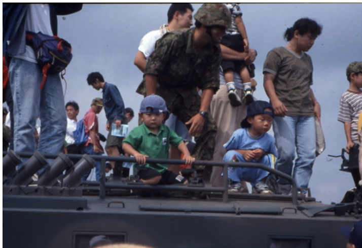
Figure 4: Some visitors are eager to familiarize themselves and their children with the tanks and other military equipment that had been used during the live firing demonstration. Being photographed in the vicinity or on top of the tanks adds excitement and creates an opportunity to review the images at home.

Unlike the playful characterization of a military conflict in cartoons, however, the demonstration has no uncertain outcome. There is very little space for improvisation or individual creativity. Rather, the event is tightly scripted and thus the emphasis shifts to its more dramatic aspects. Hence, the live firing demonstration also involves the spectacularization of violence through the combination of fire, colors, noise, smell and movement. It is this spectacularization that turns actions related to soldiering into entertaining displays.