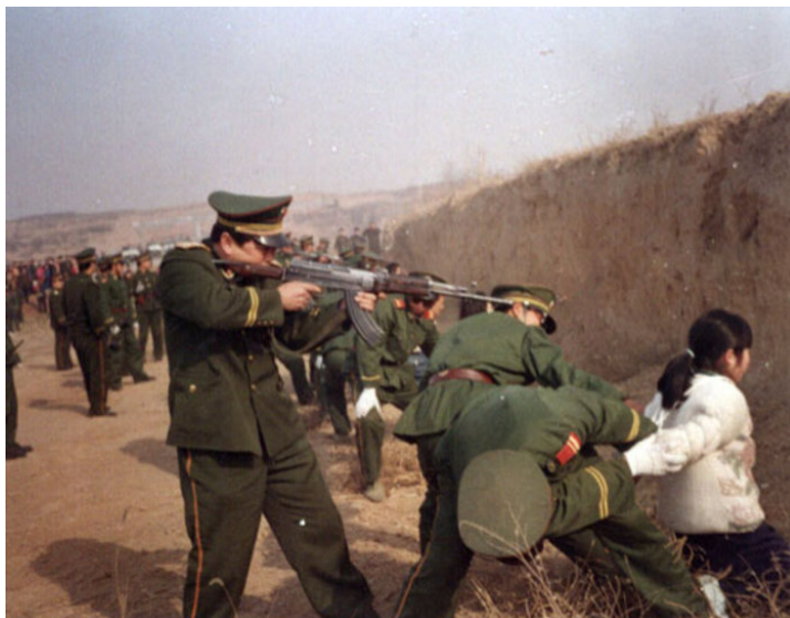
Execution by rifle in China

south and dozens of times higher than the rate in the United States.