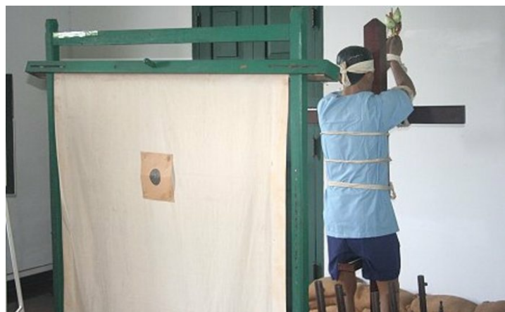
Executions in Thailand formerly took place as shown, though the shooter is standing closer in this simulation than he did at the real event.