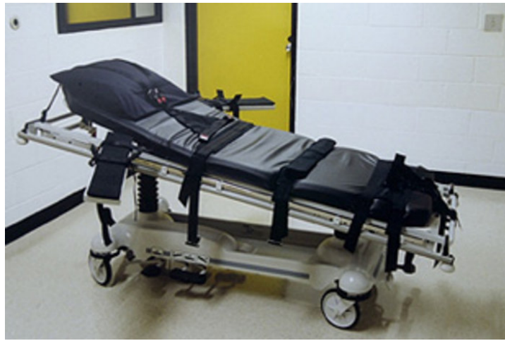
Thailand switched to lethal injection in 2003; since then it has executed six people with this method.

At the highest levels of execution in Asia, one finds retentionist nations that rely on capital punishment for crime control and a level of usage long absent from nations in the developed West. In recent years, China, Vietnam, North Korea, and Singapore all have carried out executions so frequently that there are some categories of crime for which death is a frequently used criminal sanction rather than a one-in-a-1000 penalty of chiefly symbolic importance. 6 There may be more of a contrast between nations such as these, which use execution to practical effect, and low-use countries such as India and Indonesia, than there is between states with death penalties in their statute books and those without. In some cases, the huge differences within the retentionist category reflect different stages of evolving death penalty policy. South Korea and Taiwan had much higher rates of execution a generation ago than in recent years, and the decline in the former has been so great and so sustained that South Korea now belongs in the abolitionist de facto category (because it has not carried out any executions for more than 10 years). In other cases such as India, Indonesia, and Japan, execution rates have been low for decades, though in Japan they recently have risen along with a wave of populist punitivism, from 1 or 2 per year from 2001 to 2005, to 4 in 2006, 9 in 2007, and 15 in 2008. 7