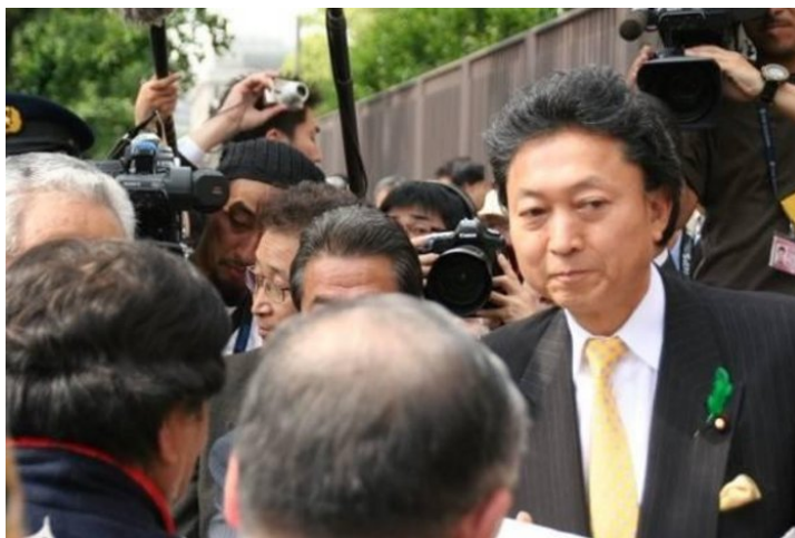
Suzuki Muneo in Ainu garb and Hatoyama Yukio greeting marchers during the May demonstration, a month prior to indigenous recognition.

In spite of the packaging, at base, however, there has been very little difference between the structure of these recent developments and those which led to the creation of the Ainu Cultural Promotion Act more than ten years ago 24 . The political meanderings that set the stage for the drafting of that Act took place during the 1990s realignment of Japanese politics, in which the LDP lost power for the first time in the postwar era. It was drafted and legislated during the switch between the Japan Socialist Party-led Murayama Cabinet and the newly revamped LDP government of Hashimoto Ryūtarō. Indeed, it is possible to group the Ainu Cultural Promotion Act together with a number of other flawed initiatives – or political full-stops – that the Murayama government introduced to try and put an end to the so-called “1955-system” of LDP-led politics. These would have to include the Atomic Bomb Survivors Assistance Act of 1994 and the Asian Women’s Fund set up in 1995 for former “Comfort Women” which excluded the possibility of direct state compensation, but were hyped as important moves on issues that had been left dormant by previous consecutive LDP governments 25 . In actual fact, what these policies finally achieved was to clear the way of both social and postcolonial baggage for what would become the more neoliberal friendly political environment to come.