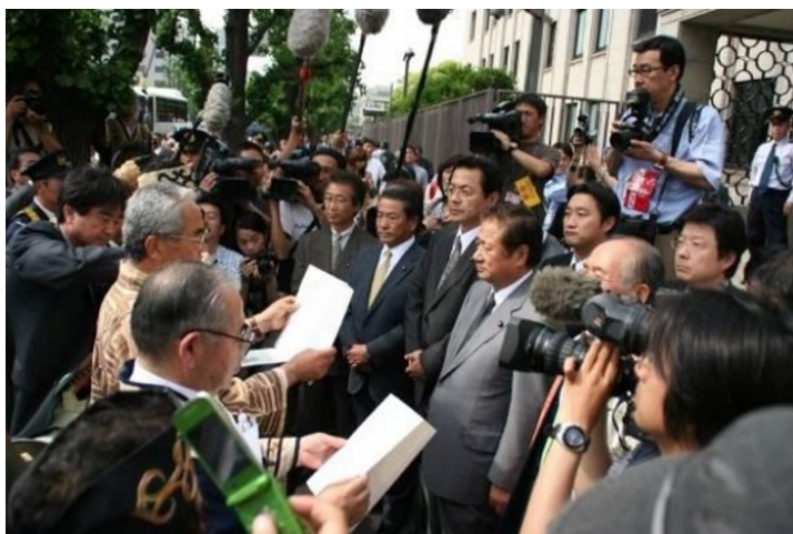
The chairman and directors of the Hokkaido Utari Kyōkai present demands to Hokkaido politicians during a demonstration on 22nd May 2008

While it is the cultural reverence offered to the idea of Japan as a "homogeneous state" ( tanitsu minzoku kokka ) that is most often commented upon in the English language literature, for many years now the only real points of concern and resistance put up by the Japanese government against legislating greater Ainu rights and recognizing them as an indigenous people in the context of the UN Declaration, have been worries over its compatibility with the Constitution, and the ability to ensure the state's final say on any kind redistribution of resources that might take place as a result. In other words, it is concerns over the status of state sovereignty that are at issue. This is why, for an equal number of years, organizations like the Hokkaido Utari Kyōkai (now renamed the Hokkaido Ainu Kyōkai, or known by its English name, the Ainu Association of Hokkaido) have repeatedly stated that they are not interested in land redistribution, or any kind of state-like independence. As the official channel between the state and Ainu affairs to date, as well as being the largest organization representing Ainu in Hokkaido, the demands of the Kyōkai, originally mapped out in their Draft Law Concerning the Ainu People of 1984 12 , have been consistently tame and concentrated on educational scholarships and employment assistance in an effort to better the living standards of its members 13 .