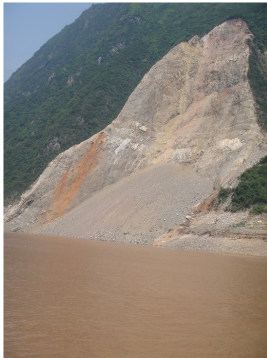
Landslide along the river (International Rivers), July 2009