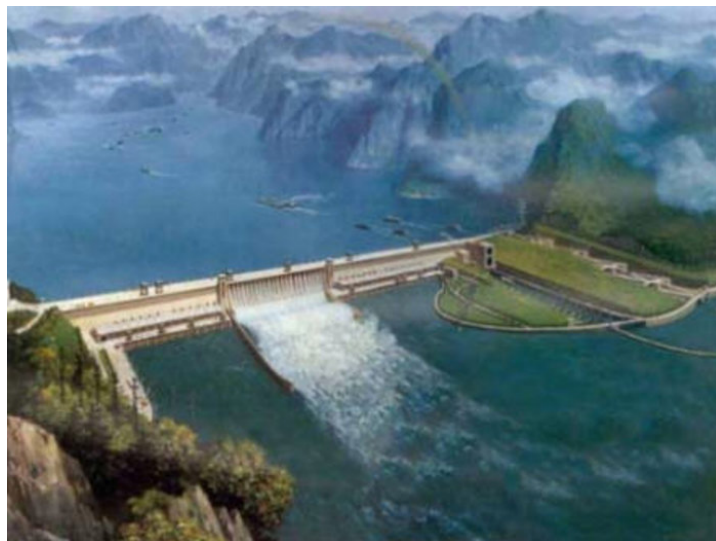
The Three Gorges Dam