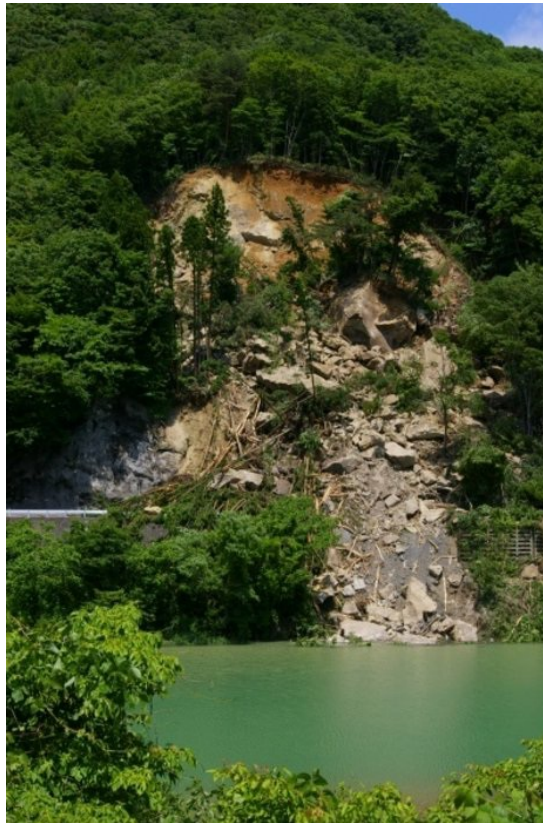
The Iwate-Miyagi Nairiku Earthquake