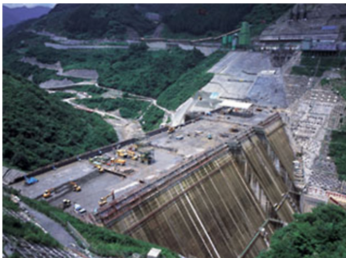
Takizawa Dam, second construction