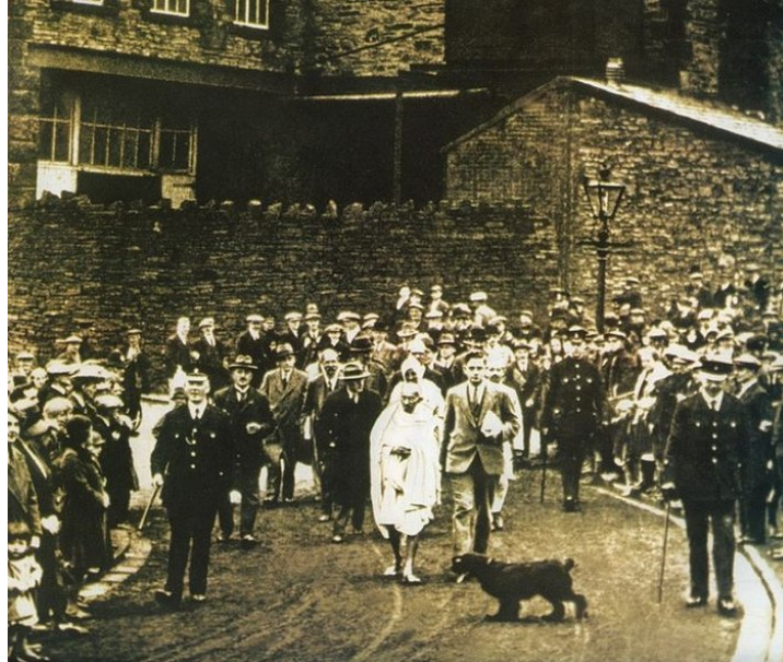
Gandhi in London in 1931 for the Round Table Conference

In 1931, on his way to the London Round Table Conference, Mahatma Gandhi was asked by a Reuters correspondent what his program was. He responded by writing out a brief, vivid sketch of "the India of my dreams". Such an India, he said, would be free, would belong to all its people, would have no high and low classes, no discrimination against women, no intoxicants and, "the smallest army imaginable." (2)