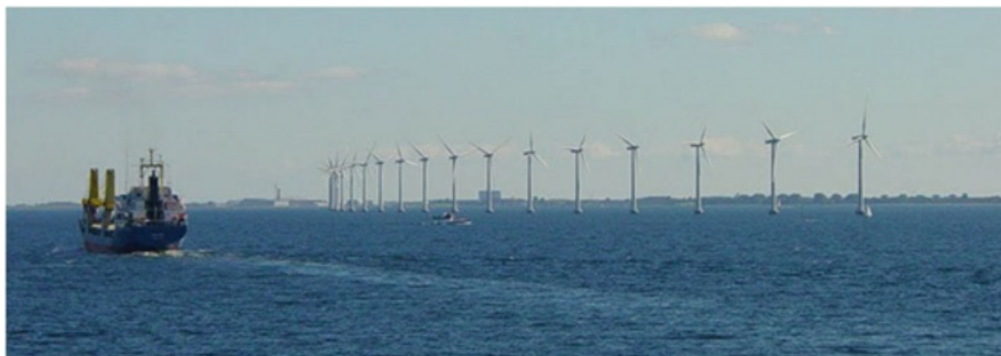
Danish wind turbines

wind power development increased, as the local population no longer had a stake in the wind energy business..”