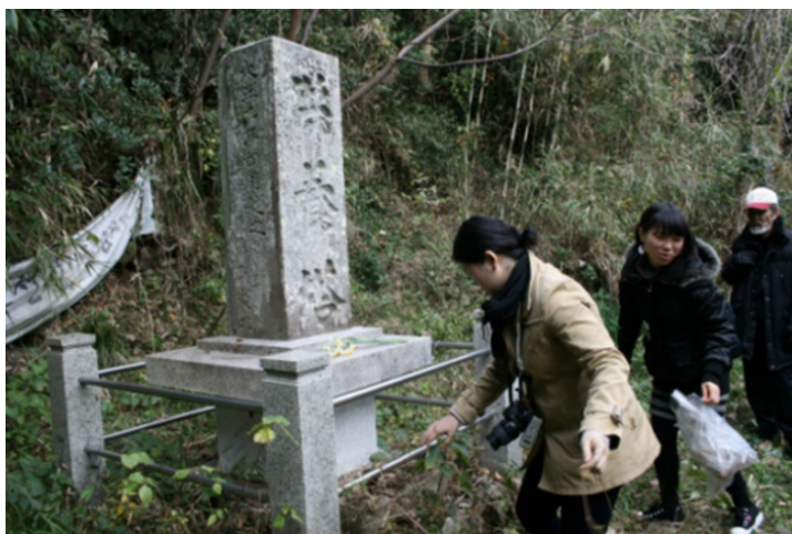
Staff members of the Oka Masaharu Memorial Nagasaki Peace Museum clean the “Senninzuka” memorial tower, which originally contained an ossuary underneath.

groups protested, charging that expressions such as “sharing joy and sorrow” flew in the face of historical fact, but the company refused to modify the inscription, claiming that it had already passed through prior discussions with the local headquarters of the Korean Residents Union in Japan (Mindan) and the General Association of Korean Residents in Japan (Chongryon). It was in the midst of this controversy that the destruction of the inscription took place.