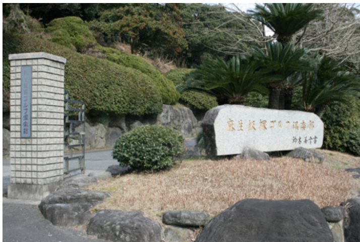
A view of the front gate at the Aso-lizuka Golf Club, of which former Japanese prime minister Taro Aso is chairman. (Kim Hyo Soon)

A map of such burial sites for the dead of Yoshikuma Mine without surviving family, drafted by Aso Mining for internal use, was filled with records of where remains were located. It indicated there were no fewer than 504 sets of remains. Thirty-three had stone markers, twenty-one had wooden markers, and the remaining 450 had no markers at all. The map was never disclosed by Japanese media. It is now almost impossible to determine the identity of the remains, since any materials that might provide a clue are no longer extant. Nearly all of the Japanese who did physical labor in mines during the Japanese Empire were from the lower class. Second and third sons of poor farming villages without rice paddies to inherit went to work at the mines if they had no better means of survival. A number of them were burakumin, subject to discrimination from society. When people died, those who had no one to take their remains were simply buried in the ground. Even if there was an intention to cremate them, the high price of coal resulted in their effective abandonment.