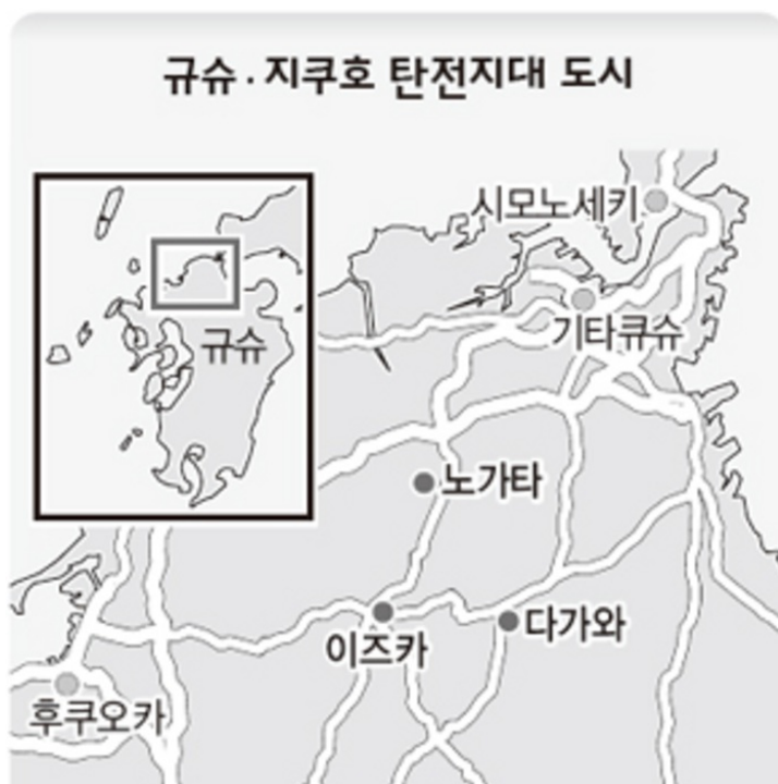
Korean map of the Chikuho region of Kyushu, Japan

Nowadays it is difficult to find any trace of the old mines in Chikuho. The top three mining centers here are Iizuka, Nogata and Tagawa. Currently, the only place where the pithead remains intact is the Hoshu mine site in Tagawa's Kawasaki Village. This is because the government gave instructions that the pithead be filled up for safety reasons when the mine was shut down. The Hoshu Mine, where a residential area stands today, is a placer mine where the shafts descend obliquely. They go down a full kilometer, and it is said that it took a miner 30 minutes to walk down and another hour to come back up. After the mine was shut down in 1945, its coal exhausted, it stayed alive for rescue training purposes.