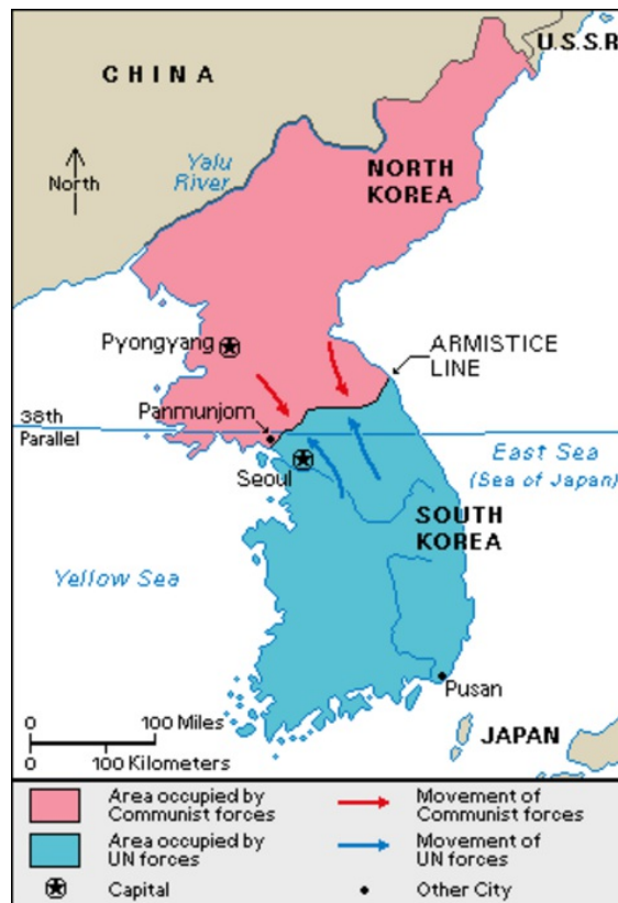
Map shows division of Korea at 1953 armistice that remains in effect today

In what Pyongyang's state media billed as a " military drill ," North Korea on January 28, 2010 fired artillery shells near its disputed border with South Korea. South Korea responded by firing its Vulcan cannons into the air – a sign, according to the South Korean press, that Seoul would not give in to intimidation. The incident made global headlines, even though these skirmishes near the Northern Limit Line dividing the countries in the Yellow Sea, which North Korea does not recognize as a legitimate border, have been ongoing for years. If U.S. President Barack Obama wants to resolve once and for all the situation on the Korean Peninsula, he's going to have to take an innovative approach to solving the underlying problem: pushing at last for a formal end to the Korean War.