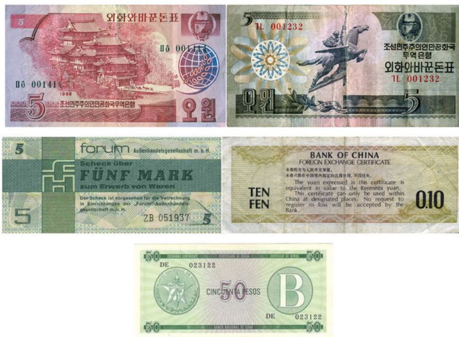
Different Foreign exchange certificates existed for foreigners from socialist countries such as China (red), and for Westerners (green-blue). Similar FECs also existed in East Germany (Forum Scheck), China, and Cuba.

My personal observations on the ground could not have been more contrasting. As a language student in Pyongyang in 1991, I could only shop in hotels and hard currency stores using foreign exchange certificates, and otherwise had to rely on allotments not only for food but even for subway rides.