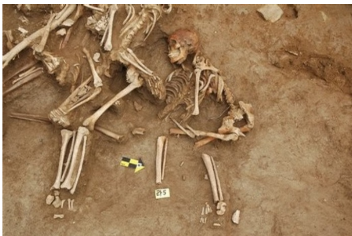
The remains of 110 victims of the mass executions of political prisoners in 1950 in Cheongwon, Chungbuk, south of Seoul. August 2007 photo, TRC

Counterinsurgency atrocities also occurred in North Korean occupied territory. As the ROK police and rightist youth groups followed the U.S. military across the 38th parallel, they encountered people they suspected to be communists and collaborators. A typical massacre occurred in Sinchon (a county located in southern North Korea). North Korea accused American troops of killing 35,380 civilians, but newly released documents disclose that right-wing civilian security police, assisted by a youth group, perpetrated the massacre. [3]