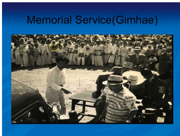
From Isolated Cases of Dealing with the Past to Comprehensive Redress

Public negligence and silence in both the United States and Korea are not just the result of the passage of time; they are also due to the collective amnesia imposed on society by the state. While scholars and journalists have raised awareness of such issues as Korean War massacres, it was essential that an official institution be given appropriate authority to investigate and verify these cases, and inform the public. This was the mandate of the Truth and Reconciliation Commission. Only after the Commission completes the truth verification process can people begin to restore the honor of the victims and conduct memorial services for the dead.