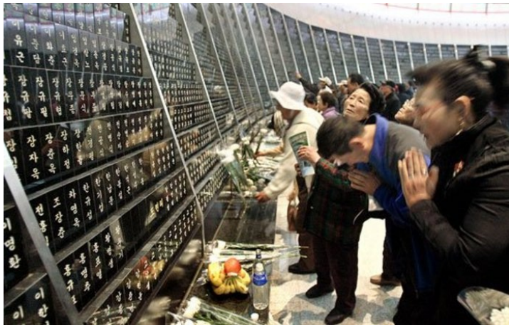
Prayers at the wall inscribing the names of the estimated 30,000 Jeju victims in the Jeju Peace Memorial Park

The Jeju April 3 incident of 1948 occurred shortly before the first general election, and was unique in the number of victims, and the lasting effect on the Jeju Island. [6] Embedded in a strong collective regional identity, the Jeju people's tragedy became a popular theme for novels and poems. While the victims' families fought alone to settle the Guchang incident, the Jeju Incident succeeded in drawing the active support of intellectuals and activists and received wide local media attention. Its historical importance in the road to the establishment of the divided governments in the Korean peninsula and the strong sense of collective victimization of Jeju people contributed to making it a national agenda after democratization. The transformation of the political and ideological landscape conditioned by democratization, along with supporters petitioning for reconciliation, emboldened the surviving families to divulge their stories. Scholars and journalists have confirmed that most of the victims of the Incident were innocent civilians, whose stories are now told in the April 3 Peace Park and Memorial Museum which opened in 2008.