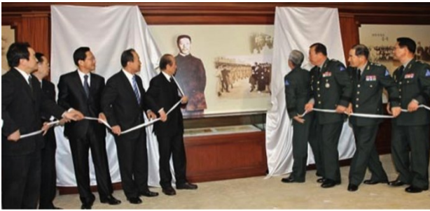
The Korean Army unveils a conference room for high-ranking officers under a new name, the Gen. Ahn Jung-geun (1879-1910) Main Conference Room, on March 25 at Army headquarters in Gyeryongdae, South Chungcheong.

lives are abandoned like sacrificial objects, the blood becomes a flowing stream and the corpses form mountains." He explained that at this time of sorrow with Western occupation of the East, the "best measure would be for Eastern people to unite as one for defense." But because Japan ignored this trend and instead planned its own imperialist aggression against China and Korea, he assassinated Ito out of the judgment that there was no choice but to start a "righteous war for Eastern peace."