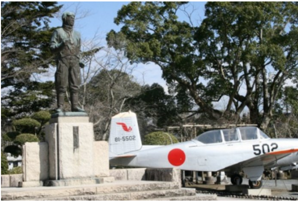
A statue glorifying the kamikaze special forces is located at the Chiran Peace Museum for Kamikaze Pilots.

listed among the fatalities, nor can one find any comment on the misguided measures of the Japanese leadership in hurling young Japanese men into an abyss of tragic death. When asked what he thought about critics' charges about the glorification of a misguided war, Matsumoto responded, "That is something for each individual to view and feel for himself." It was impossible to erase the overall impression that the site was enjoying tourism benefits by selling the souls of young men who died absurdly tragic deaths. Matsumoto said that some 500 thousand people visit every year, through school trips and other means. On my way back, the use of the English name "peace museum" weighed heavily on my mind.