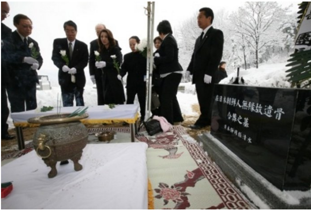
Members of Chongryon and Mindan hold a repatriation ceremony for the return of the remains of Korean conscripted laborers on March 10 at Mang-Hyang Cemetery, located along Mang-Hyang Hill (Nostalgia Hill) in Cheonan City, South Chungcheong Province.