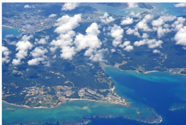
Aerial photograph of Cape Henoko

On January 6, 2010, the U.S. Marine Corps Okinawa announced its position on the relocation of Futenma. In order to counter contingencies effectively, a helicopter squadron must be deployed within a 20-minute distance from a base where ground forces are standing by. This is why they claim Futenma's function must be relocated to Henoko, which is adjacent to Camp Schwab and Camp Hansen where the Marines' ground troops are stationed.