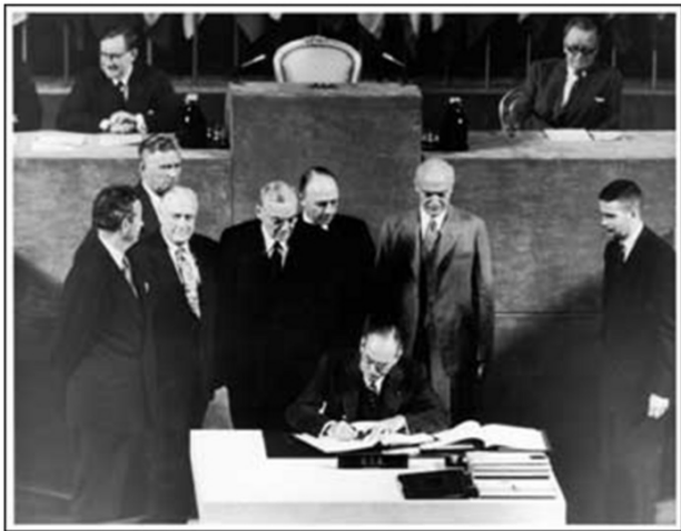
Dean Acheson signs the San Francisco Treaty for the United States

When they were allowed to return home a few years after the war ended, many people from central Okinawa found their hometowns and villages turned into vast military bases. Reluctantly, they began to live alongside barbed-wire fences, some earning a meager livelihood by working for the bases. This is how Ginowan City, which now surrounds the Futenma Air Station, came into being [1].