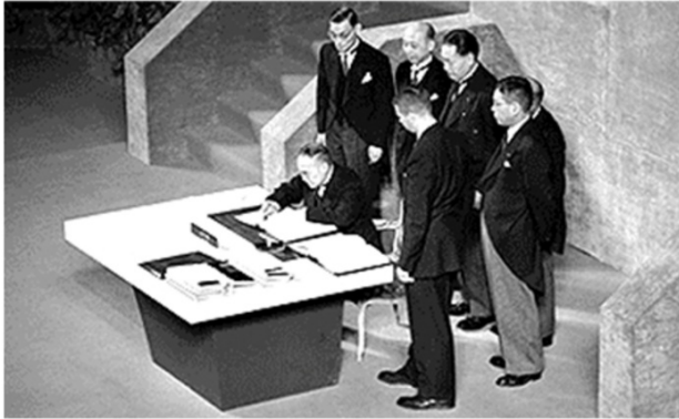
Yoshida Shigeru signs the San Francisco Treaty for Japan

This year marks the fiftieth anniversary of the conclusion of the revised Japan-U.S. Mutual Security Treaty (Ampo). The original treaty was signed on September 8, 1951, the same day the San Francisco Peace Treaty was signed. One of its provisions stipulated that Japan must guarantee the U.S. the same stable use of military bases as it did under the occupation. Without accepting that requirement, Japan could never have won its independence.