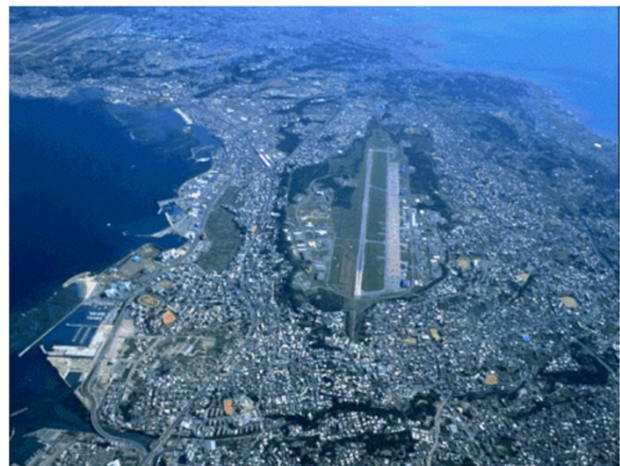
Futenma Air Station occupies 25% of densely populated Ginowan City