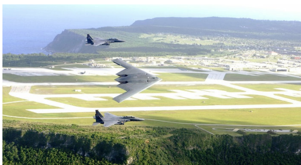
Andersen Air Force Base