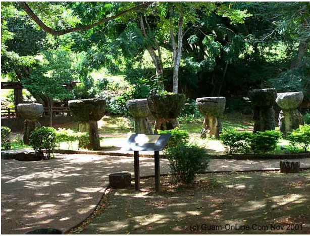
Latte stones, the foundations of Chamorro homes from 500 A.D.

cargo included Mexican silver, Spanish administrators, missionaries, and provisions for the garrison in the Marianas. En route from Acapulco, the vessels replenished supplies of food and water on Rota and Guam. 6