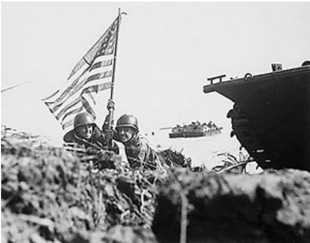
Planting the US flag on Guam

Hailed as "liberation forces," U.S. troops landed on Guam on July 21, 1944 after thirteen consecutive days of naval bombardment in which thousands lost their lives.