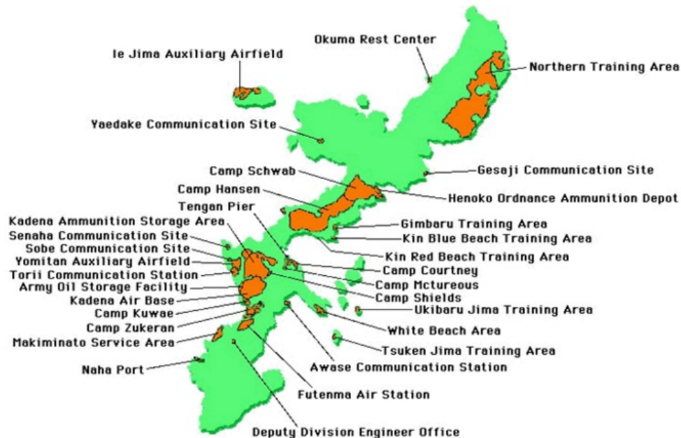
Map from the website of Okinawa Prefecture. Torishima, which is not shown on this map, is about 60 miles west of the Okinawa Island.