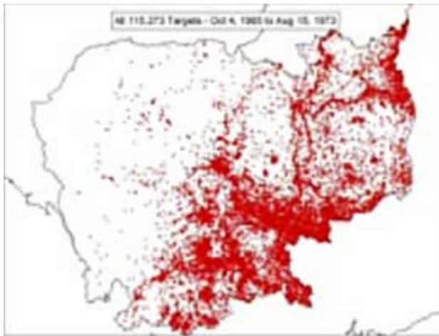
Map showing 115,273 targets of U.S. secret bombing of Cambodia between October 1965 and August 1973.