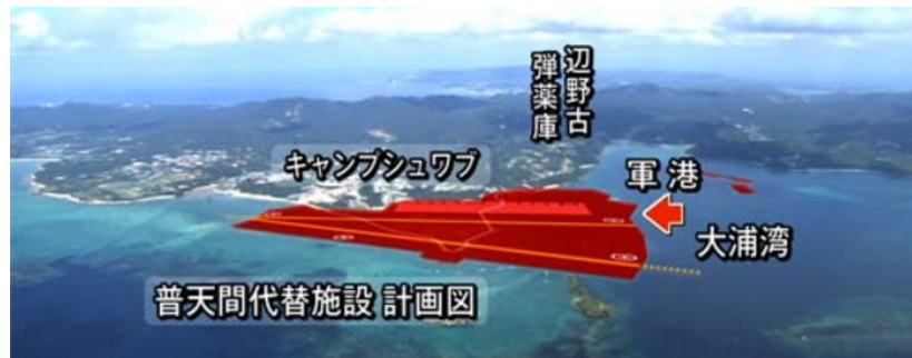
“Futenma Relocation” Plan

The plan to build a base in Henoko is called a “relocation plan,” but the Henoko plan entails a military port in addition to an air station. Rather than a “relocation facility,” it is a new military complex quite different in nature from Futenma Air Station. With a military port, weapons can be loaded directly onto ships from the Henoko Ammunition Depot.