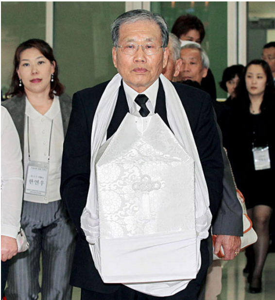
A somber Korean man returning to Seoul's Gimpo International Airport on May 19, bringing home the remains of his father who was killed during the war while conscripted by the Japanese military.