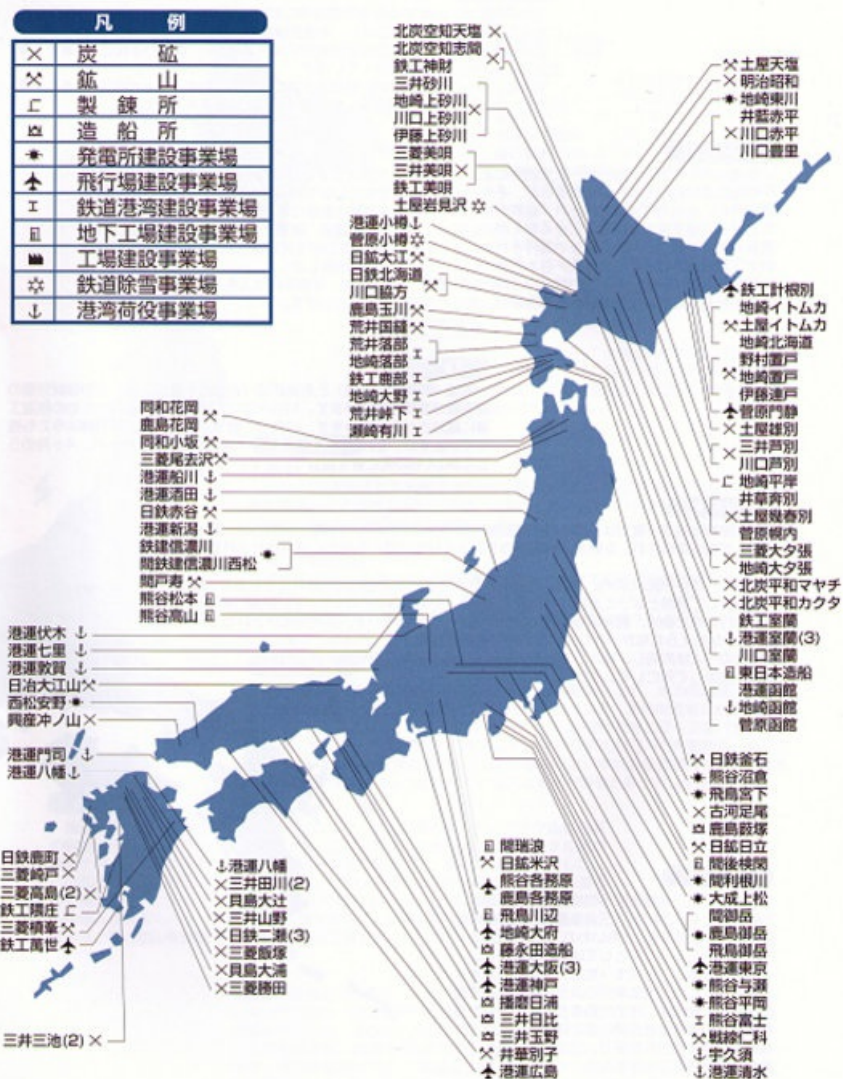
A map of the 135 Chinese worksites during WWII, based on information compiled by the Japanese government in 1946 and then suppressed until the 1990s. Koreans and Allied POWs were similarly forced to work at sites spanning the length of Japan's home islands.

compensate non-Japanese Class B/C war criminals, since Japanese war criminals have long received military pensions and other assistance. The bill will test the depth of the party's often-stated intention to deal squarely with history, and raise obvious questions about why Japan compensates war criminals but not their victims.