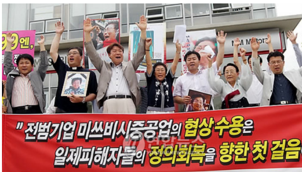
Supporters of Korean forced labor redress stand in front of a Mitsubishi car showroom in Gwangju, Korea, on July 15, cheering the news that Mitsubishi Heavy Industries intends to compensate members of the female "volunteer corps."

A petition signed by more than 130,000 South Korean citizens and 100 members of the National Assembly demanding the women receive compensation and an apology was presented to Mitsubishi by a Korean lawmaker one day before the company's annual shareholders meeting on June 24. Mitsubishi reportedly announced at the meeting that the teishintai issue "cannot be evaded from a humanitarian standpoint," in no small part because the South Korean Assembly member also threatened a global consumer boycott.