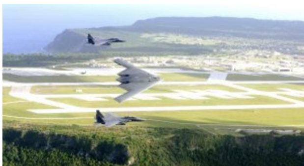
Andersen Air Force Base

As battles become bases, so bases become battles; the bases in East Asia acquired in the Spanish American War and in World War II, such as Guam, Okinawa and the Philippines, became the primary sites from which the United States waged war on Vietnam. Without them, the costs and logistical obstacles for the US would have been immense. The number of bombing runs over North and South Vietnam required tons of bombs to be unloaded, for example, at the Naval Station in Guam, stored at the Naval Magazine in the southern area of the island, and then shipped to be loaded onto B-52s at Andersen Air Force Base every day during years of the war. The morale of ground troops based in Vietnam, as fragile as it was to become through the latter part of the 1960s, depended on R & R at bases throughout East and Southeast Asia which allowed them to leave the war zone and be shipped back quickly and inexpensively for further fighting (Baker 2004:76). In addition to the bases' role in fighting these large and overt wars, they facilitated the movement of military assets to accomplish the over 200 military interventions carried out by the US in the course of the Cold War period (Blum 1995).