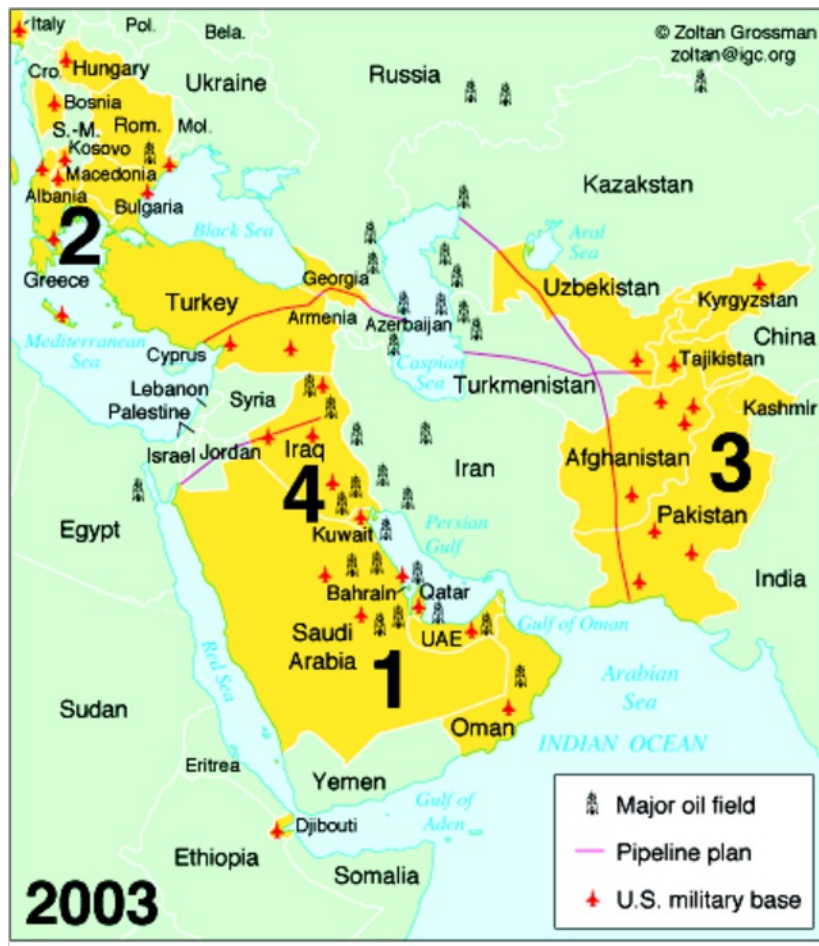
New U.S. Military Bases, 1991-2003

Pentagon transformation plans result in the design of US military bases to operate ever more as offensive, expeditionary platforms from which to project military capabilities quickly anywhere. Where bases in Korea, for example, were once meant primarily to defend South Korea from attack from the north, they are now, like bases everywhere, project power in many directions and serve as stepping stones to battles far from themselves. The Global Defense Posture Review of 2004 announced these changes, focusing not just on reorienting the footprint of US bases away from Cold War locations, but on grounding imperial ambitions through remaking legal arrangements that support expanded military activities with other allied countries and prepositioning equipment in those countries to be able to “surge” military force quickly, anywhere.