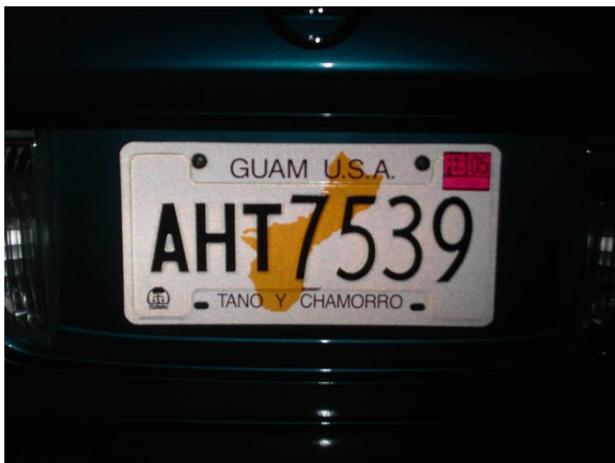
Guam License plate

Are Guam’s bases domestic or overseas bases? Are there racial underpinnings to the differences in how Guam’s basing is handled?