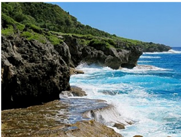
Caves on Pagat Island

This military expansion has been planned in Washington, with acquiescence and funding from Tokyo, in order to relocate some 8,000 Marines and 9,000 dependents from Okinawa, as well as US Navy, Army, and Air Force assets and operations to Guam and the Commonwealth of the Northern Marianas (CNMI) (Erickson and Mikolay 2006). The plans are breathtaking in scope, including removal of 71 acres of coral reef from Apra Harbor to allow the entry and berthing of nuclear aircraft carriers, the acquisition of land including the oldest and revered Chamorro village on the island at Pagat for a live-fire training range, and an estimated 47 percent increase in the island's population, already past its water-supply carrying capacity. The military expansion is being planned with one-third of the island already in military hands and a substantial historical legacy of environmental contamination and depletion, external political control, and other problems brought by the existing military presence.