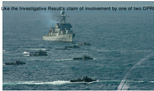
Foal Eagle exercise