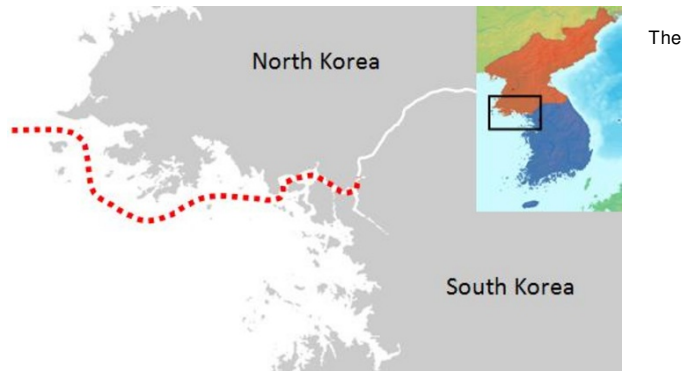
Northern Limit Line

Maps showing the location of the Cheonan incident, near Paekryong [Baengnyeong] Island, just south of the maritime extension of the demilitarized zone, are particularly important given DPRK contesting of ROK claim to the waters surrounding this island. 20 The five-page Investigative Result did not include a map or provide the precise coordinates of the Cheonan at the time of sinking. Nor did it state whether the Cheonan was in DPRK, ROK, or neutral waters at the time of the alleged torpedo explosion. Including this information would make plain the obvious risks the ROK military takes any time it dispatches a ship to this contested and therefore dangerous area, all the more so during a US-ROK joint military exercise.