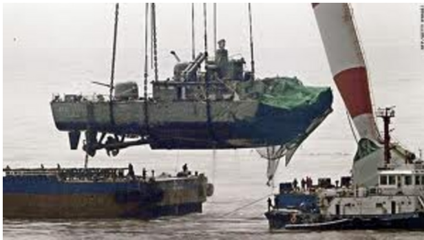
The stern of the Cheonan lifted from the water

Mainstream media coverage of responses to the findings has, with rare exceptions, reiterated the findings of the ROK report, not only in the United States and South Korea but throughout Europe and the Anglophone world as well. These analyses typically accept at face value the report's findings of DPRK guilt—the "overwhelming" evidence of the torpedo's DPRK manufacture and markings, two DPRK submarines out to sea at the time of the Cheonan's sinking, and the absence of submarines from neighboring countries in the area at the time of the sinking.