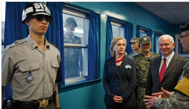
Secretary of State Hillary Clinton and Secretary of Defense Robert Gates at the DMZ, with a DPRK guard observing through the window (From “U.S. to add to Sanctions on N. Korea” July 22, 2010, New York Times )

of threats and belligerence toward its neighbors, and take steps now to fulfill its denuclearization commitments and comply with international law. 8 The Secretary of State repeated these warnings during a second trip in July, this time with Secretary of Defense Robert Gates, as they toured the DMZ.