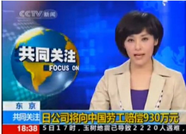
Chinese news coverage of the Nishimatsu-Shinanogawa settlement and its rejection by plaintiffs involved in the lengthy litigation. (CCTV video available)

As the agent of the Chinese plaintiffs, the author therefore issued a protest letter to Nishimatsu on April 19, 2010, but the corporation has not made any response. In the Settlement Agreement signed on April 26, 2010, Nishimatsu continued to include the plaintiffs who had already openly stated their rejection of this Settlement Agreement in its "settlement" arrangements. While Nishimatsu has yet to resolve its wartime forced labor issue, it violates de facto the human rights of the Chinese forced labor victims once again.