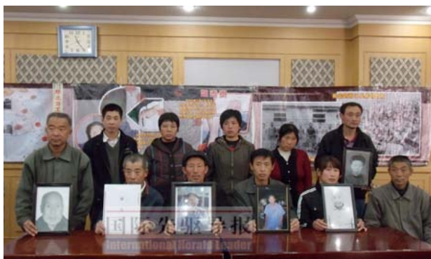
The five plaintiffs in the Shinanogawa lawsuit against Nishimatsu, along with heirs of two other victims, announce their opposition to the compensation pact at a Beijing press conference on April 27.

The truth is that all the plaintiffs of the Nishimatsu-Shinanogawa forced labor lawsuit in Japan, who were confirmed by both Nishimatsu and the plaintiffs' Japanese attorneys in June 2009 as the representatives to negotiate with the company, did not sign any settlement agreement with Nishimatsu. The root cause for this are: (a) Nishimatsu insisted to state in the content of the Nishimatsu-Shinanogawa Settlement Agreement [2] that "Chinese people's right to claim had been waived", but did not allow the plaintiffs to express side by side in the Settlement Agreement that they could not accept this wrong viewpoint; (b) In order to make clear its unyielding position of not taking any legal liability, Nishimatsu deliberately uses the term "atonement money (償い金)" to ambiguously name the damages that they should have paid to the Chinese victims; and (c) Moreover, Nishimatsu unreasonably requires those who accept the "settlement" to bear hereafter the obligation of ensuring that the corporation will be immune from any future liability from any other parties for this case. This article discusses these and other shortcomings of the unacceptable "settlement" in detail.