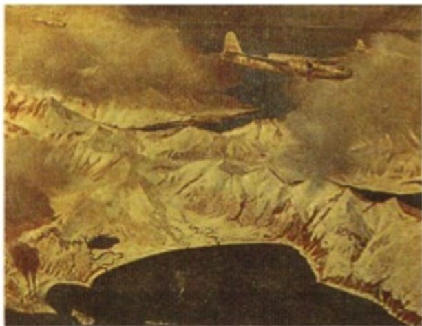
Ogawara Shū, The Bombing of Attu , 1945

Interestingly, both artists painted the same battle: the Japan-US battle on Attu Island near Alaska in 1943. Both paintings are currently in the war art collection at The National Museum of Modern Art, Tokyo mentioned above. The battle is known as the first incident in which the Japanese military employed the strategy of gyokusai , or collective suicide. As part of the Battle of Midway that started in June 1942, Japan occupied the Kiska and Attu Islands in Alaska. By May 1943 the Japanese troops ran out of food and weapons, and their commander, Colonel Yamazaki Yasuyo, decided to choose "the path of the Japanese warrior," or death over life. Those who were injured and unable to fight were asked to commit suicide so that they would not be captured by the enemy. On the night of May 29, 1943, after performing banzai to the Emperor, the last forces waged a sudden attack on the Americans, which resulted in brutal, hand-to-hand combat. Except for 28 prisoners, all Japanese on the island (over 2,000 people) died, either killed by the Americans or blown up by their own hand. 21 The following morning, the surviving Americans found piles of Japanese corpses.