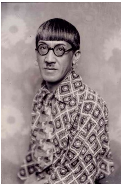
Fujita Tsuguharu, ca. 1920s (1886-1968)

In the summer of 2008, while the Ogawara Shū Museum located in the small town of Kuchan, Hokkaido, held a modest exhibition of his works titled The Real Landscape of Myself II , another former war painter was in the spotlight in Sapporo, the capital and largest city of Hokkaido. From July 12 th to September 4 th , the Hokkaido Museum of Modern Art held the Léonard Foujita Exposition , which was funded by the Hokkaido Shinbun newspaper and supported by the General Council of Essonne in France. 8 It featured nearly two hundred works by Fujita Tsuguharu (1868-1968), also known as Léonard Foujita. Fujita was an internationally renowned artist of École de Paris, the school of non-French modernists who resided in Paris, the world art capital of the 1920s. He was arguably the most famous Japanese artist in the world during the prewar era. In Japan, Fujita was also known as a prolific wartime painter of the late 1930s and early 1940s. Due to his wartime activities he was ostracized for many years in postwar art circles, but following a large retrospective organized by The Museum of Modern Art, Tokyo in 2006, there was renewed interest in the man and his work. Although Ogawara and Fujita have never been discussed together, their concurrent exhibitions in Hokkaido in 2008 provide an opportunity to examine these two artists who lived through the twentieth century.