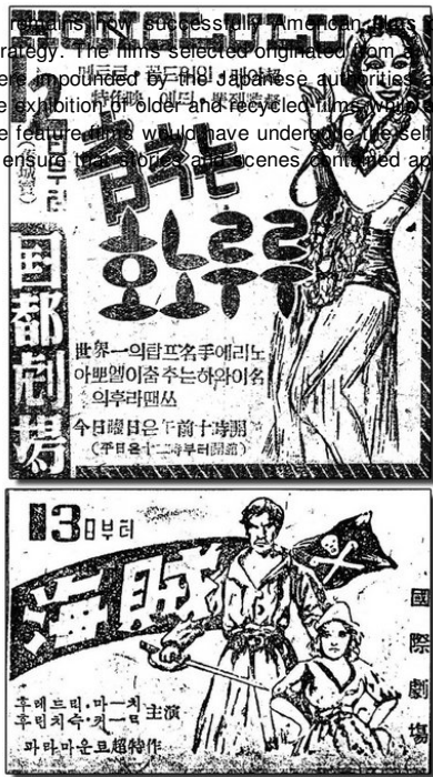
Figure 3. Advertisement. Top: 'Honolulu', Hansung Daily 14 July 1946, p. 4; bottom: 'The Buccaneer', The Korean Free Press , 13 May 1946, p. 2.

The question remains why successful American films distributed and exhibited in the southern half of the Korean Peninsula meshed with USAMGIK's occupation strategy. The films selected originated from a variety of sources, including film distributors in Shanghai and U.S. film distributors' vaults in colonial Korea that were impounded by Japanese authorities after Pearl Harbor. Yet, regardless of the origins of these prints, the US film industry was able to profit from the exhibition of older and recycled films, and at the same time exploiting them for their cultural contents. In fact, before appearing in Korea, most if not all these feature films would have undergone the self-censorship process implicit in Hollywood's Motion Picture Production Code. This industry initiative attempted to ensure that all scenes contained appropriate content for domestic viewers. USAMGIK would no doubt have been confident that these