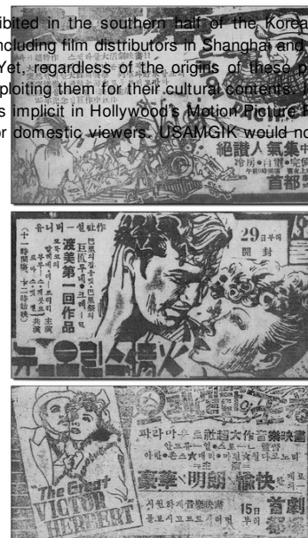
Figure 5. Advertisements. top: 'Union Pacific' (1939), Jayu Shinmoon 5 July 1948, p. 3; middle: 'The Flame of New Orleans', Jayu Shinmoon 5 July 1948, p. 3; bottom: 'The Great Victor Herbert', Jayu Shinmoon 14 July 1948, p. 3.

star-driven films – often in the running for Oscars – upheld the kind of moral values and accurate portrayals of (American) society that would not offend Korean audiences.