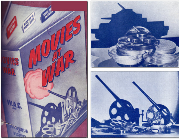
Figure 1. left: cover of the Movies at War, Vol. 1 pamphlet published by the War Activities Committee, Motion Picture Industry, New York City, 1942. The phrase 'Cannon and Camera!' appears above the bottom right image (p. 3). The phrase 'Fights for Freedom' appears below the top right image (p. 6). 17

social acceptance. Heterosexual coupling and marrying without parental or family consent was linked to the desire for social mobility through acquiring material wealth in a modern society.