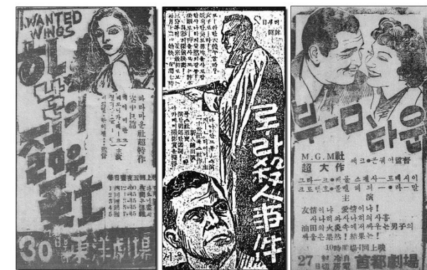
Figure 4. Advertisements. left: 'I Wanted Wings' (1941), Jayu Shinmoon 4 May 1948, p. 2; middle: 'Laura' (1944), Daidong News 8 June 1948, p. 2. right: 'Boom Town' (1940), Jayu Shinmoon 27 August 1948, p. 2.

Clearly, however, there was a limit to what the USAMGIK and CMPE could achieve in the short time at their disposal. Nor were CMPE and the US film industry the only parties at fault. Other foreign films such as the French gangster