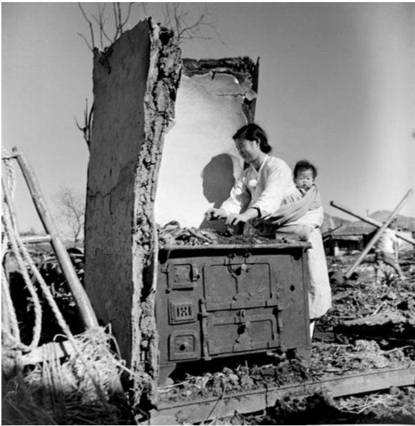
A woman examines the remains of her stove in the ruins of her home in Seoul in early October 1950. United Nations Photo Archive, Photo # 187890

meant to lay the groundwork for the longer term “reconstruction” of the Korean peninsula. For the public health teams, however, the acute shortages of food and medical supplies soon contributed to devastating outbreaks of typhus: as people sought alternative sources of food, especially rodents, they became susceptible to the bites of fleas infected with the bacteria that causes the disease.