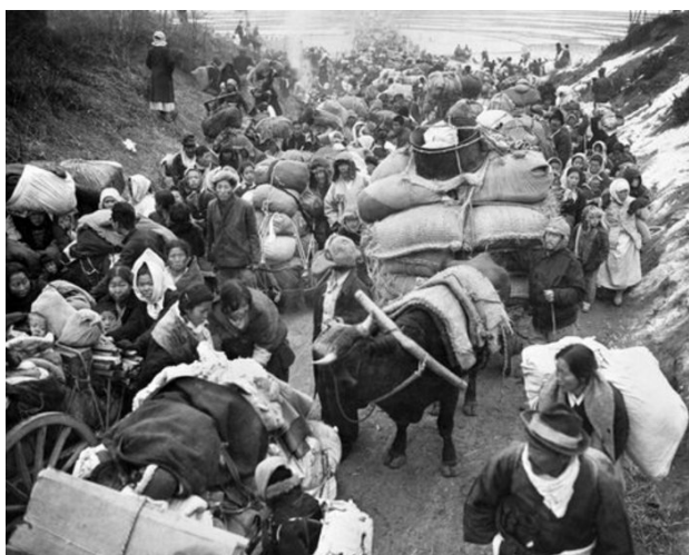
Battle-weary Korean civilians crowd a Korean road in late January 1951 seeking safety from the continuous fighting.

soldiers from firing on or toward civilians, but to prevent civilians from hindering military offensives and other activities, an important distinction which reflected the acceptance of violence toward civilians underlying UNC relief programs. Refugees were viewed not so much as a group to be protected, but as a "problem" for civil assistance teams. A booklet issued by the United Nations Command entitled "Civil Assistance in Korea" stated in its opening paragraph that refugees presented "a constant problem to civil assistance." 10 The logic of this strategy fed a perception that civilians moving in war-zones were legitimate military targets for US and other UNC soldiers.