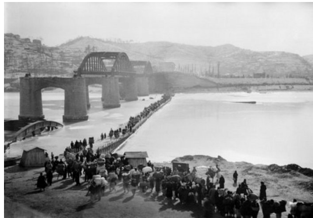
A column of refugees crosses the provisional bridge over the Han River in early December 1950.