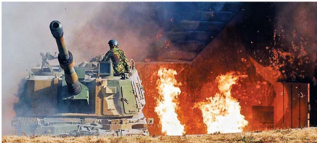
A K-9 Marine artillery base on Yeonpyeong Island under attack by North Korea on Tuesday ["N.Korean Shelling 'Aimed for Maximum Damage to Lives, Property'." Chosun Ilbo , 26 November 2010.

The Washington Post went one step further and reported that Most of the shells landed on a military base on Yeonpyeong island [emphasis added]. 85