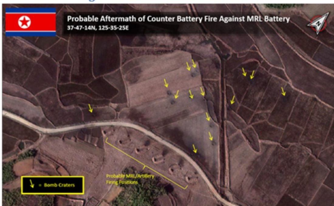
Fig 5: Evidence of inaccurate fire

In this satellite photo released by the U.S. private intelligence agency Stratfor, rice paddies and fields in North Korea bear traces of South Korean artillery shells ["Spies Intercepted Plans for Yeonpyeong Attack in August ". Chosun Ilbo , 2 December 2010.