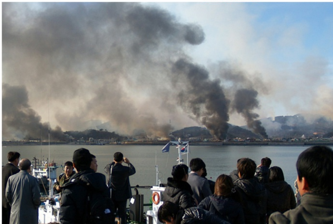
Fig3: Smoke from rocket fire over Yeonpyeong island

This picture taken on November 23, 2010 by a South Korean tourist shows huge plumes of smoke rising from Yeonpyeong island in the disputed waters of the Yellow Sea on November 23, 2010. North Korea fired dozens of artillery shells onto a South Korean island on November 23, 2010, killing four people, setting homes ablaze and triggering an exchange of fire as the South's military went on top alert.