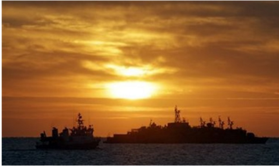
ROK ships near Yeonpyeong Island in the aftermath of the shelling

Frequent large scale joint exercises between the US and ROK militaries, under US command, which have been a feature of the peninsula for decades, stretch back in various forms to the late 1940s. The ROK military also has its own exercises, with little ostensible US involvement. Though since it is dependent on the US for high-tech intelligence – surveillance from aircraft and satellites, and signals interception – the Americans are never far away. In addition, the ROK military is under the wartime operational control (OPCON) of the US. Former President Roh Moo-hyun had negotiated for the US to relinquish operational control in 2012 but under Lee this has been pushed back to 2015. 19 Control of Joint military exercises was also scheduled to be transferred to the ROK, but this has also been rescinded. 20