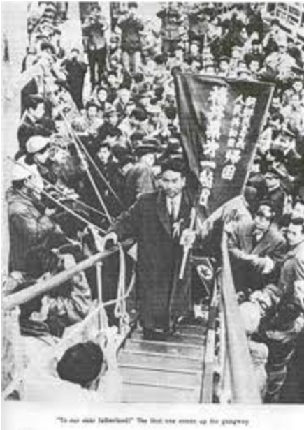
Boarding a ship for North Korea