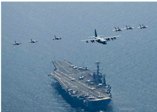
Marine Corps C-130 Hercules leads a formation of F/A-18C Hornets, right, and A/V-8B Harriers as they fly in formation over the aircraft carrier USS George Washington in the seas east of the Korean peninsula summer 2010

The most difficult challenge, however, probably will come when the truth about the sinking of the Cheonan has been brought to light. Whichever of the two hypotheses turns out to be correct, the situation is dire. While the proposition that war must be prevented will still hold true even if Hypothesis A is correct, it will be an unnerving task to manage an utterly dangerous situation in which a North Korean regime not only criminal but impervious to rational calculations possesses nuclear weapons as well. On the other hand, if in accordance with Hypothesis B there was no North Korean attack on the Cheonan, but our government has deliberately distorted and even fabricated the evidence, this too is a highly unnerving and dangerous state of affairs. We cannot exclude the possibility that in order to cover it up the government may resort to other extreme measures. And it would hardly be desirable to see a legitimately elected government falling into a state of paralysis. Only the combination of sound common sense on the part of ordinary citizens and the rational capabilities of various individuals in their respective fields, transcending the antiquated framework of liberal versus conservative, will overcome this crisis and realize a new leap toward the future.