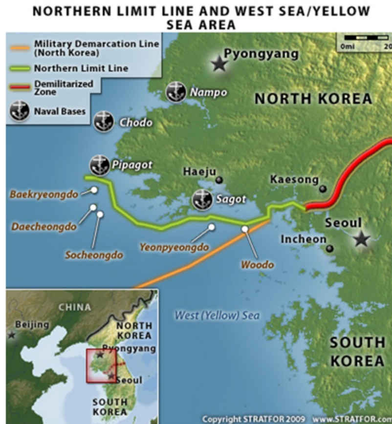
The scene of the two major incidents near the contested Northern Limit Line 2010

As for the Yeongpyeong incident itself, whatever its cause or justification, the fact that North Korea deliberately opened fire on South Korean territory is enough to bring shock and anger. To make matters worse, the incompetence and sloppiness of the South Korean government in its initial response caused uneasiness among the citizens, and its belated displays of toughness and escalation of tension, proclaiming "readiness for a full-scale war," has added to South Korean people's sense of insecurity and even stirred their anger.