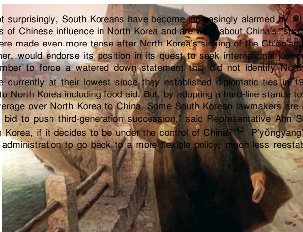
This portrait of a young man was photographed by a Canadian tourist in 2010 and bears a striking resemblance to Kim Jong-un in a setting and layout that is similar to depictions of the young Kim Il Sung. Many North Korea experts believe that the portrait marks the first glimpse of how the North Korean regime plans to "sell" the heir apparent to the public. 38