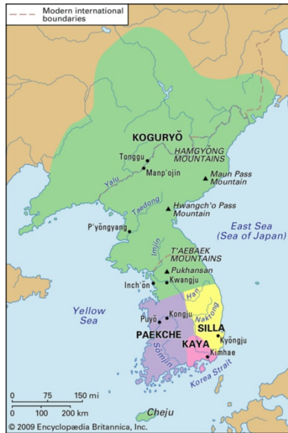
Map of the Three Kingdoms (300 AD-700AD)

China's treatment of Koguryŏ has not been all that different from its treatment of other peoples and states that are now part of the People's Republic of China. 17 Knowing that the threat to the integrity of the Chinese nation has historically always come from internal challenges to its central authority, China has long sought to exercise control over its diverse ethnic population by promoting a common Chinese identity under the rubric of a "multi-ethnic nation" and conducting assimilationist policies. 18 The link made between Koguryŏ and Northeast provinces like Jilin, whose largest minority is ethnic Korean, has clearly been a way to increase the notion of a Chinese identity among ethnic minorities. According to Quan Zhezhu, the Deputy-Governor of Jilin Province, the Northeast Project was "undertaken to elevate the tradition of patriotism and to maintain unity and stability of [the] Chinese state, the integrity of territorial rights, stability of ethnic minority communities, and national solidarity." 19 In other words, the Project raises political as well as scholarly issues "linked to China's territorial rights and sovereignty." 20