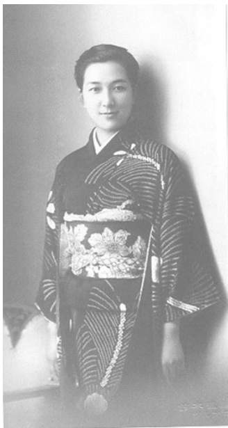
Photograph at age 20