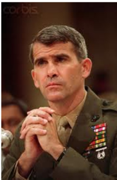
Oliver North at Iran-Contra Hearings

In 1989 I published the following article, "Northwards without North: Bush, Counterterrorism, and the Continuation of Secret Power." It is of interest today because of its description of how the Congressional Iran-Contra Committees, in their investigation of Iran-Contra, assembled documentation on what we now know as Continuity of Government (COG) planning, only to suppress or misrepresent this important information in their Report. I was concerned about the committees' decision to sidestep the larger issues of secret powers and secret wars, little knowing that these secret COG powers, or "Doomsday Project," would in fact be secretly implemented on September 11, 2011. (One of the two Committee Chairs was Lee Hamilton, later co-chair of the similarly evasive 9/11 Commission Report).