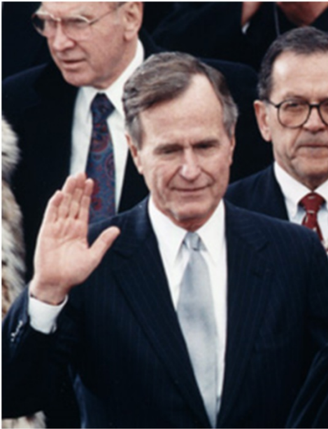
G.H.W. Bush 1989

Both levels availed themselves of their own special communications networks, Project 908 and FLASHBOARD, to avoid accountability to the regular administrative hierarchy. 12 Communications personnel for the first secret network were attached to the rarely mentioned White House Communications Agency (WHCA), an agency whose relevance to the JFK assassination and 9/11 I have outlined elsewhere. 13 Meanwhile Bush presided over a maze-like series of overlapping restricted groups and agencies with changing names, among which were the National Program Office and the Defense Mobilization Planning Systems Agency, responsible for the various Doomsday initiatives. 14