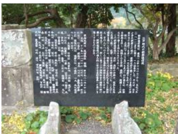
A stone monument for Korean embassies to Japan during the Edo period in Tsushima. The bilingual explanation board that the Korean visits brought Japan sophisticated knowledge, art and culture, and talks of deep respect towards the Koreans.

While the posters regularly refer to historical and political issues between Japan and Korea, many do not seem to have much interest in actual history or politics. For example: 'Korea is an enemy country that is invading Takeshima; Japan is at war with Korea'; 'In Tsushima Koreans are doing every evil thing imaginable, including raping Tsushima women', 'Koreans have a history of massacring Tsushima people ... Historically you Koreans owe Tsushima Islanders more than you can ever repay'. Clearly, accuracy is not a major concern for these participants; it seems that these statements are not even meant to be a representation of reality. Strong words like 'evil', 'war', 'massacre', 'rape', and 'invasion' are exchanged as empty signs without any historical or evidential basis. Disturbing visual images are also circulated, for example, bleeding pheasants laid on a rising-sun flag, Korean children's 'fuck Japan' art exhibition, or a YouTube clip of 'a Korean attacking a Japanese boy'. However, it is unclear which war, which invasion, or which massacre these postings refer to. In many cases they have no referent to reality and no one seems to mind. The comments are discursively productive, consolidating the 'us'/'them' antagonism and maintaining the moral superiority of the Japanese who are constructed as a victim.