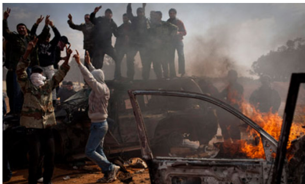
Anti-Gadhafi fighters in Benghazi

Qatari flags fly prominently in rebel-held Benghazi. After pro-Gadhafi forces retook the town of Ras Lanuf last week, Libyan state TV broadcast images of food-aid packages bearing the Qatari flag.