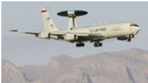
US Awacs monitor Libya

Officially, Nato will only describe the presence of American Awacs planes as part of its post-9/11 Operation Active Endeavour, which has broad reach to undertake aerial counter-terrorism measures in the Middle East region.