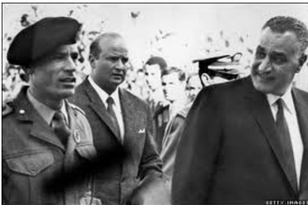
Gaddafi and Nasser in a 1969 Photo.

"If Muammar Al Gaddafi behaved paranoid, it was for good reason. It wasn't long after he reached the age of 27 and led a small group of junior military officers in a bloodless coup d'état against Libyan King Idris on September 1, 1969, that threats to his power and life emerged - from monarchists, Israeli Mossad, Palestinian disaffections, Saudi security, the National Front for the Salvation of Libya (NFSL), the National Conference for the Libyan Opposition (NCLO), British intelligence, United States antagonism and, in 1995, the most serious of all, Al Qaeda-like Libyan Islamic fighting group, known as Al-Jama'a al-Islamiyyah al-Muqatilah bi-Libya. The Colonel reacted brutally, by either expelling or killing those he feared were against him." 3