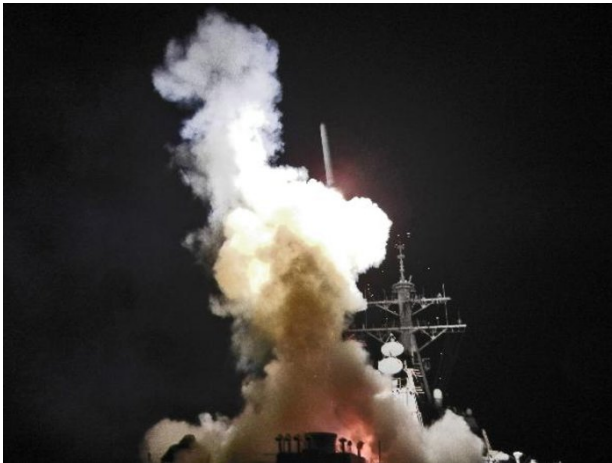
USS Barry launches a Tomahawk missile in support of Operation Odyssey Dawn in the Mediterranean Sea, March 19, 2011.

The world is facing a very unpredictable and potentially dangerous situation in North Africa and the Middle East. What began as a memorable, promising, relatively nonviolent achievement of New Politics - the Revolutions in Tunisia and Egypt - has morphed very swiftly into a recrudescence of old habits: America, already mired in two decade-long wars in Iraq and Afghanistan, and sporadic air attacks in Yemen and Somalia, now bombing yet another Third World Country, in this case Libya.