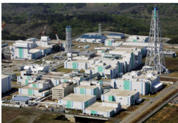
Rokkasho Nuclear Fuel Reprocessing Plant, 2008.

Other low-level wastes are held in 200-liter drums, both at nation-wide reactor sites and at the Rokkasho repository. Rokkasho's projected eventual capacity is for three million drums in forty vast repositories, each containing 10,000 drums, destined eventually to be covered in soil, with something like a mountain built over them. After that, they must be closely guarded for at least 300 years. These repositories spread like giant poisonous mushrooms across the once beautiful backwater of rural Aomori prefecture.