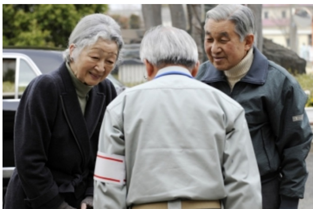
Emperor and Empress speak with town mayor of Kazo, Saitama on April 8 while visiting a makeshift shelter. On April 15, TEPCO announced that it would provide "provisional compensation" of approximately $12,000 to tens of thousands of households ordered evacuated, perhaps permanently, from the 13-mile exclusion zone.

The way forward out of the current disaster remains unclear. The debate over Japan's energy and technology future will be long and hard, but what is now clear is that Japanese democracy has to rethink the frame within which this elite was able to overrun all opposition and push the country to its present brink. The crisis is not just one of radiation, failed energy supply, possible meltdown, the death of tens of thousands, health and environmental hazard, but of governability, of democracy. Civic democracy has to find a way to seize control over the great irresponsible centres of fused state-capital monopoly and open a new path towards sustainability and responsibility. A new mode of energy generation and of socio-economic organization has to be sought. Ultimately it has to be a new vision for a sustainable society.