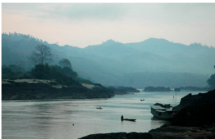
Site of the proposed Xayabouri Dam

A telling case is underway whose outcome will demonstrate whether or not the cooperative arrangement represented by MRC will take note of the SEA as the most comprehensive scientific assessment to date. The first of the mainstream dams, Xayabouri, was notified by Lao PDR for prior consultation by MRC member states over a six month period to April 2011. This is the first time that other MRC countries have been asked to give their opinions on a dam proposed in the territory of one of their neighbours. Xayabouri is a Thai project inside Laos, whose lead contractor is the Thai company Ch. Kanchang, whose financing would be mainly by Thai banks, and whose market for power is primarily in Thailand. On 19 April, the Joint Committee of MRC held a special meeting to decide what position to take on the dam. The outcome of the meeting was that the countries agreed to disagree , based on concerns expressed both in technical reviews of the dam proposals and a series of public consultations, at which strong opposition to Xayabouri and other mainstream dams was expressed. The matter was referred upward to the Ministerial Council level, effectively putting the dam in abeyance.