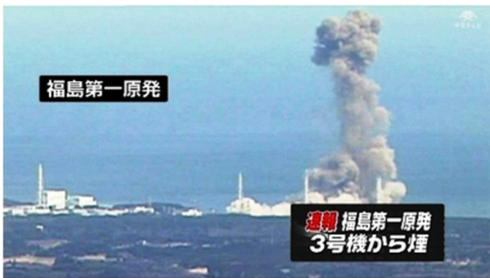
Reactor 3 explosion on March 14

I believe that in the explosions at Fukushima Daiichi, huge amounts of spent fuel were blown sky high. The ground contamination out to 100 km at Fukushima is worse than Chernobyl, the dose rates higher. And Fukushima has contaminated Tokyo with 35 million people. The population of the 200 km radius is also enormous, about 10 million. Most of the Chernobyl stuff fell away from big population centers. Luckily it went north and west and not to Kiev which is south. Fukushima is still boiling its radionuclides all over Japan. Chernobyl went up in one go. So Fukushima is worse.