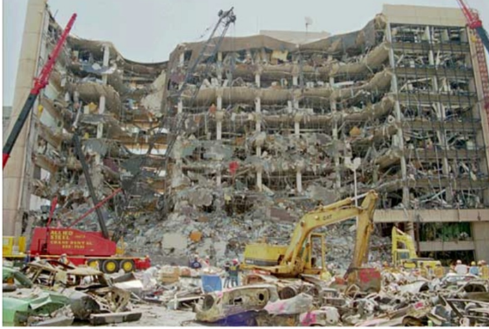
Oklahoma City bombing

It is worth recalling that in the 1993 bombing of the World Trade Center the attackers were trained by a member of al Qaeda, Ali Mohamed, who almost