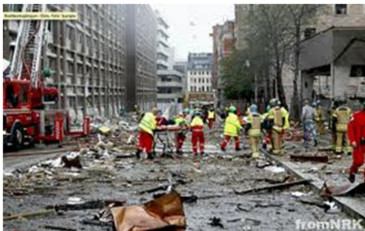
The Oslo bombing