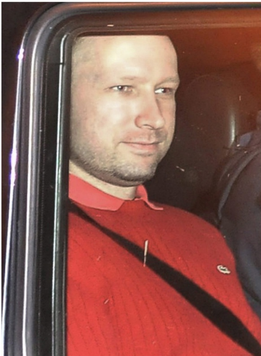
Breivik under arrest

Breivik's mayhem on July 22, 2011, (henceforth 7/22) has forced me to clarify my definition of a deep event, to distinguish between those which are merely unsolved or mysterious in themselves, and those which have proved to be part of a larger systemic mystery grounded in the structures of either society itself, or its shadow underworld ( demi-monde, Irrewelt ), or in some combination of the two. As I wrote three years ago, "The unthinkable – that elements inside the state would conspire with criminals to kill innocent civilians – has become not only thinkable but commonplace in the last century." 1