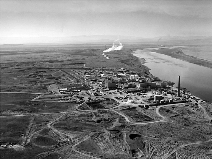
Hanford reactors along the Columbia River, 1960

A reactor for producing plutonium was established at Hanford in the northwestern United States. The greatest waste product generated by this reactor was an enormous quantity of heat. Hanford discharged this heat into the Columbia River, and it was Admiral Hyman Rickover, the “Father of the Nuclear Navy,” and the Electric Boat Company who first realized that this heat could be used as a source of engine propulsion power for submarines.