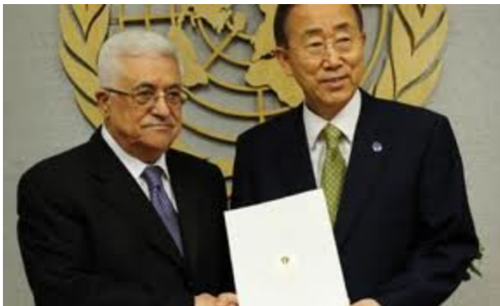
Palestinian President Mammoud Abbas with UN Secretary General Ban Ki-moon

Since then, however, there has been a backlash against the extreme anti-Islam policy of the United States in the form of an anti-U.S., anti-Israel Islamist movement; since the revolution in Egypt last spring, Islamism has been accelerating under the rubric of democratization. Previously pro-Israel Egypt and Turkey have since turned anti-Israel, and the Palestinian Authority, once a puppet of the U.S. and Israel, is increasingly defiant in its attempt to gain United Nations membership. Even in formerly secular Tunisia and Morocco, the Islamists are rising in the elections .