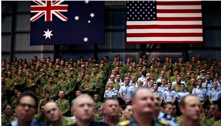
American Marines and Australia Soldiers listen to Obama address in Darwin, Australia

In his remarks to the Australian parliament on November 17, President Obama declared that the U. S. was making the Asia-Pacific region a top priority. While promising a continued U.S. military presence in the region, Obama also expressed his intention to strengthen U.S.-China cooperation. This declaration, however, was made at the same time as Obama announced a series of anti-China measures: to station U.S. forces permanently in Australia for the first time, to promote the Trans-Pacific Partnership (TPP) – a multilateral trade agreement that excludes China – and to discuss the South China Sea Islands at the ASEAN summit, to Beijing's displeasure. Therefore, the Japanese media view Obama's emphasis on Asia as strengthening an anti-China containment ring.