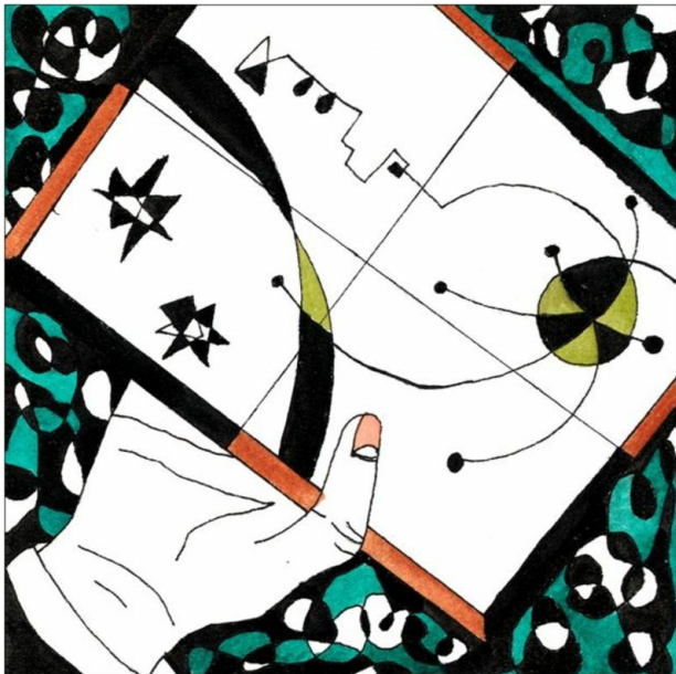
With this ticket you can go to the ends of the earth and beyond