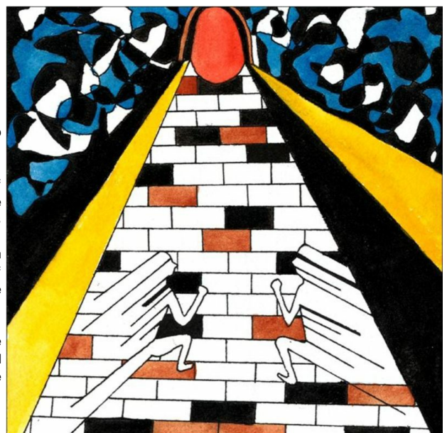
The two boys ran as fast as their two legs would take them

But, in a flash Campanella is gone, despite Giovanni's conviction that he could go to the ends of the Earth and beyond with him. Campanella disappears into the Coal Sack, a pitch-black bottomless pit that is actually a dark nebula in the skies of the