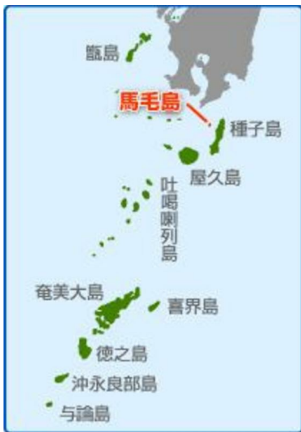
Mage Island (in red), In the Satsunan Islands just south of Kagoshima

Mage Island, now a couple of hours by a fast boat (ca. 115 kms) south of the city of Kagoshima, is located about 12 kilometres west of Tanegashima, the island in the East China Sea where in the 16th century Francis Xavier is said to have first landed in Japan, and about 40 kilometres north of the World Heritage island of Yakushima. With a circumference of 16 kms and an area of just over 8 square kms, washed by the “warm current” ( kuroshio ) and enjoying sufficient rainfall to feed no less than 16 rivers, its tiny space is (or perhaps was) home to an astonishing biodiversity on both sea and land, from nesting turtles and giant hermit crabs to several species of killifish ( medaka ), and over 400 of birds including the ruddy kingfisher and the skylark, and known in particular for its own sub-species of deer, the “Mage deer.” Mage was only sporadically populated by groups of fishermen till modern times. The researcher who probably knows the island best, having visited it with his students each year between 1987 and 2000, after which access was closed, describes it as a “Treasure island” of life. 1