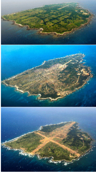
showing apparent breach of forest law by unlicensed development From top down, the island in June 2004, November 2006, and July 2011

Nishinoomote City, administratively the locus of Mage Island, suffers the same effects of depopulation and decline as other island and mountain districts.