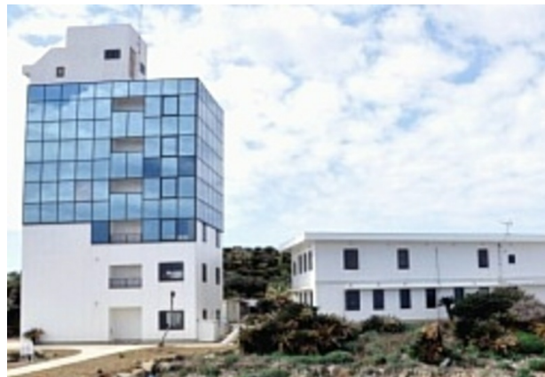
“Beyond the Law” Tasuton Airport Buildings, Mage Island February 2010

Late in 2011, the City began to show increasing interest in the remarkably shielded private realm that had grown apparently beyond all authority, taking steps to try to gain physical access in order to levy taxes on works that from aerial inspection seemed to include at least a 6-story office block and several buildings presumed to be staff quarters, 12 keen also to investigate apparent breaches of various laws including the Forest Law and to survey the deer population because of suspicion of its drastic decline.