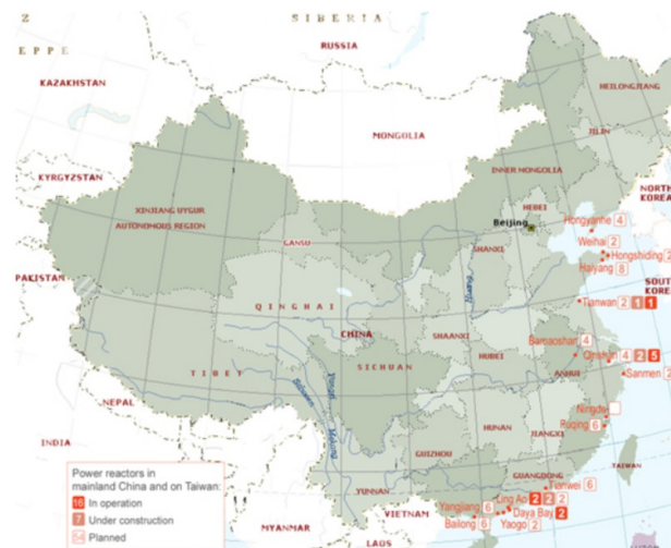
Mainland China in 2010 had 16 nuclear power reactors in operation, 7 under construction, and 34 planned. China's existing and planned nuclear power sites (IAEA map based on July 2010 data.)

This difference in nuclear energy stances reflects critical changes since the Three Mile Island and Chernobyl disasters in the 1970s and 1980s. Nuclear power has increasingly become a key component of electricity diversification strategies throughout the developing world. More significantly, it has entered the realm of the attainable for many developing countries. Nuclear power was not initially a credible energy policy option for these countries as they did not possess the necessary capital and capacity to develop the complex infrastructural, technical and financial arrangements necessary for the successful operation of a civilian nuclear energy programme. However, many of these countries have experienced economic take-offs in the decades since the two major pre-Fukushima nuclear disasters, namely, Three Mile Island and Chernobyl. They have consequently been faced with a commensurate growth in energy demand and this has served to enhance the appeal of nuclear power.