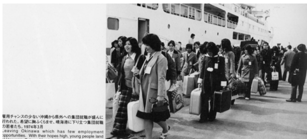
Okinawans as a minority

After travel restrictions ended with Okinawa's reversion to Japan in 1972, more people went to the mainland for work and study. Some settled there, but most returned to Okinawa even though it offered fewer employment opportunities. A survey conducted in 2000 estimated that 70,000 migrants and their descendants resided in Osaka Prefecture, mostly in Osaka City; 12,000 in Hyōgo Prefecture, mostly in Kobe and Amagasaki Cities; and 45,000 in Kanagawa Prefecture, mostly in Yokohama and Kawasaki Cities, for a combined figure of 127,000 in those three prefectures. While there is considerable movement back and forth, the total number of Okinawans currently residing on the mainland has been estimated at 300,000, between 20 and 25 percent of Okinawa Prefecture's 1.3 million population. 8 Although fewer now live in what have been called "ethnic communities," many maintain close connections with other Okinawans on the mainland. 9