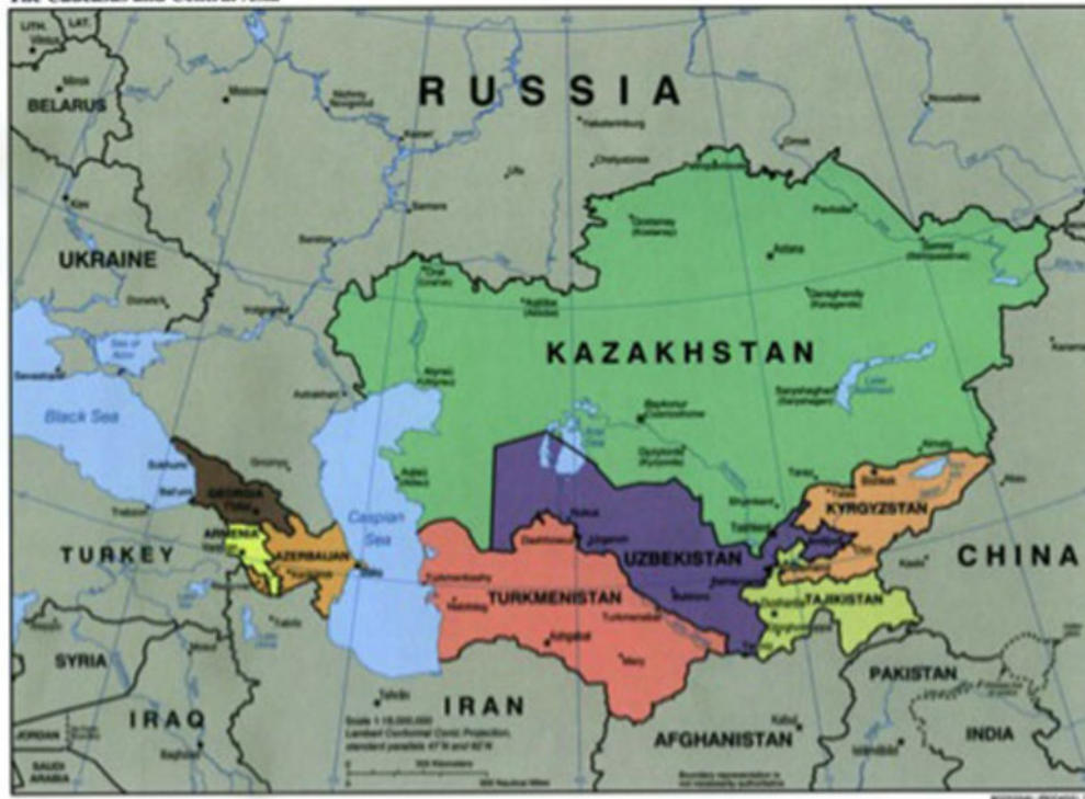
The Caucasus and Central Asia

A little farther upstream the Kambarata-I is planned, with an installed capacity ten times that of its recently completed smaller sibling. The plans for the Kambarata-I also date from the Soviet period. When completed it will be the largest dam of the entire Naryn-Syr Darya River system (hereafter Syr Darya), in terms of height as well as power generating capacity. The electricity generated by these two hydropower dams ought to address the severe energy shortages that have been haunting Kyrgyzstan during the last decade, notably in the winter period. The winter of 2009-2010 saw forced power outages of over 12 hours per day in parts of the country ( here ).