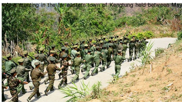
Kachin Independence Army in a 2009 photo

19-20, the Shan State Army (SSA) and government representatives signed a 12-point agreement to “restore peace” in that long restive part of the country. Apart from humanitarian issues such as resettlement and “rehabilitation” of people displaced by the fighting, the agreement only contains references to “existing laws” on all major issues; autonomy is not on the negotiation table. The government’s primary aim of the negotiations is to get the SSA to accept the 2008 constitution and convince armed rebels to return to what successive military administrations have consistently termed as the “legal fold”. Talks with Karen National Union (KNU) rebels, who are also fighting for autonomy in the areas they control, have been along the same lines. They have been offered business opportunities in exchange for peace but no promise of constitutional reform. Because the 2008 constitution does not recognize federalism, there is no negotiating space for concessions that would jeopardize the military’s traditional notion of a unitary state with itself at its apex. Ethnic leaders have been told that “a discussion about federalism is not even on the table.” But as the outbreak of hostilities in Kachin State shows, ceasefires only freeze underlying problems without providing lasting solutions. There are still at least 50,000 men and women under arms