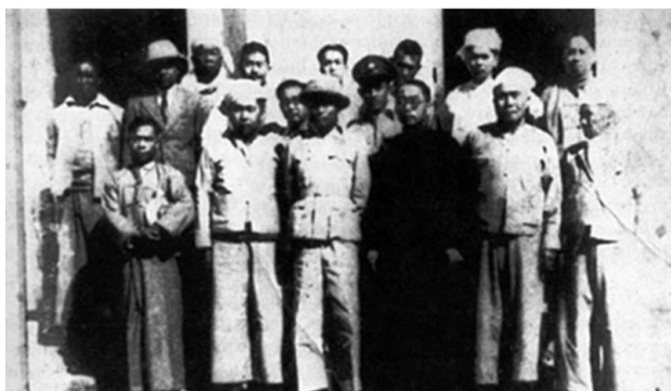
Aung San (center) at the Panglong Conference

across the country in ethnic resistance forces. Last year, to address these underlying problems, Suu Kyi called for the convention of a second “Panglong Conference,” in reference to an agreement that her father Aung San, who led Burma’s struggle for independence from Britain, signed with representatives of the Shan, Kachin and Chin peoples at the small market town of Panglong on February 12, 1947. The agreement paved the way for a new federal constitution, which was adopted in September of that year, and independence for Burma which was declared on January 4, 1948.