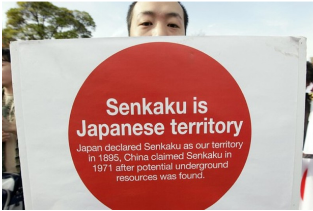
A Japanese demonstrator in a December 2010 Tokyo demonstration