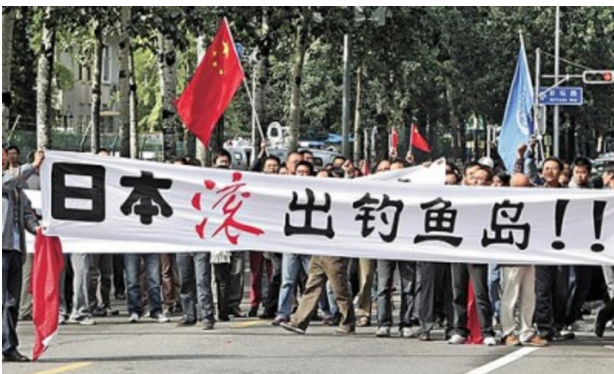
Chinese demonstrators on September 18, 2010 at the Japanese Embassy in Beijing

In this fashion, the Bao-Diao Movement in the Chinese sphere has risen and fallen, to rise again, in response to developments of recent history. One wonders how clearly the ruling Democratic Party of Japan understands this background and prevailing conditions.