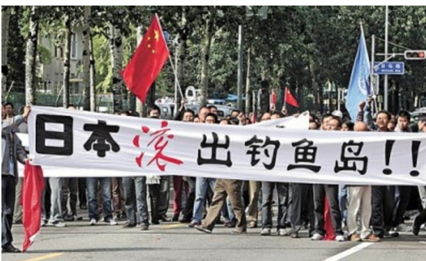
Chinese demonstrators on September 18, 2010 at the Japanese Embassy in Beijing

In this fashion, the Bao-Diao Movement in the Chinese sphere has risen and fallen, to rise again, in response to developments of recent history. One wonders how clearly the ruling Democratic Party of Japan understands this background and prevailing conditions.