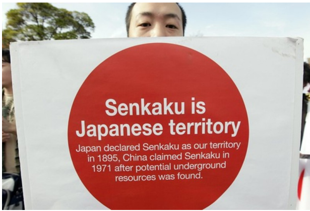
A Japanese demonstrator in a December 2010 Tokyo demonstration