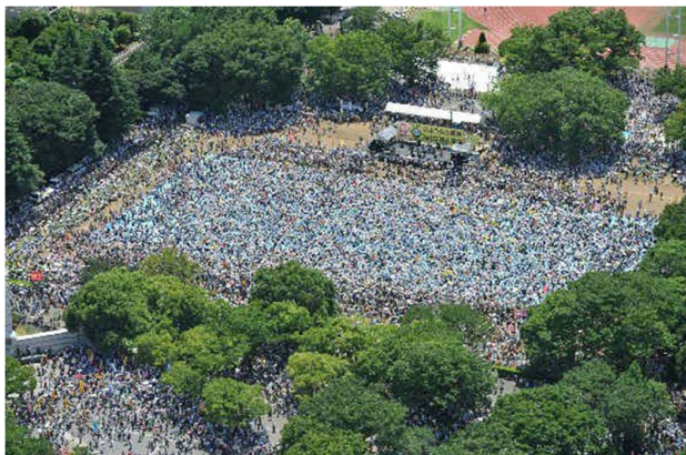
July 16, 2012 demonstration in Tokyo's Hibiya Park. Organizers estimated that 170,000 people participated

In a country long considered lacking a culture of protest, thousands of people are gathering every Friday night in Tokyo's Nagatacho political district to protest nuclear energy and the government's decision to restart reactors.