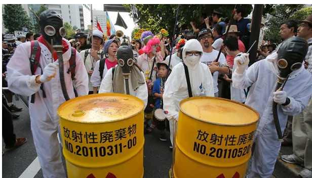
Anti-nuclear protesters, wearing gas-masks, beat metal drums as they march near Japan's Parliament in Tokyo on July 29.

In a series of editorials in the Asahi, Oguma addressed readers more directly. On March 9, 2012, he exhorted his readers to "think for themselves" in deciding whether nuclear power is appropriate for Japan, pointing out the importance of an informed citizenry and the possibility of protest as a viable and even necessary tool of social change, albeit, one that requires more of each individual than they are used to giving. On May 9, 2012, he points to the impossibly high economic and social costs required to somehow minimize or even manage the risk that nuclear power poses to society and humanity. Oguma points to the need for "courage" in facing up to entrenched interests of banks and insurance companies, corporations and bureaucrats, in a Japanese state that is still authoritarian, even in dysfunction.