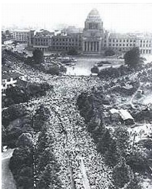
Protesters surround the Diet in 1960 Amman demonstration

In the 1960 Security Treaty protest, the height of activity only lasted for about a month. The May 1968 revolution in Paris only lasted about two months. A boom would not last for more than six months. Even if the situation in front of the Prime Minister's Official Residence should be settled, I think other protests will take place somewhere else.