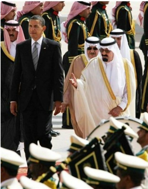
Obama with Saudi King Abdullah, 2010

in the anti-Soviet jihad in Afghanistan during the 1980s. After the Soviet occupation ended, the Yemeni government encouraged its citizens to return and also permitted foreign veterans to settle in Yemen. Many of these Arab Afghans were co-opted by the regime and integrated into the state's various security apparatuses. Such co-optation was also used with individuals detained by the Yemeni government after the September 11 terrorist attacks. As early as 1993, the U.S. State Department noted in a now-declassified intelligence report that Yemen was becoming an important stop for many fighters leaving Afghanistan. The report also maintained that the Yemeni government was either unwilling or unable to curb their activities. Islamism and Islamist activists were used by the regime throughout the 1980s and 1990s to suppress domestic opponents, and during the 1994 civil war Islamists fought against southern forces. 28