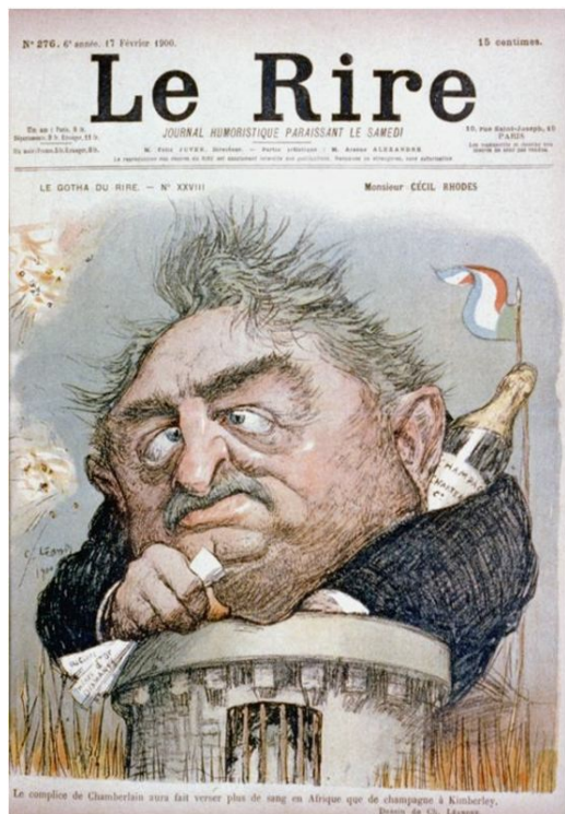
French caricature of Rhodes, showing him trapped in Kimberley during the Boer War, seen emerging from tower clutching papers with champagne bottle behind his collar.

Rhodes, already wealthy from South African diamonds and mining concessions he had acquired by deceit in Matabeleland. Rhodes now saw an opportunity to acquire goldfields in the Transvaal as well, by overthrowing the Boer government with the support of the uitlanders or foreigners who had flocked to the Transvaal.